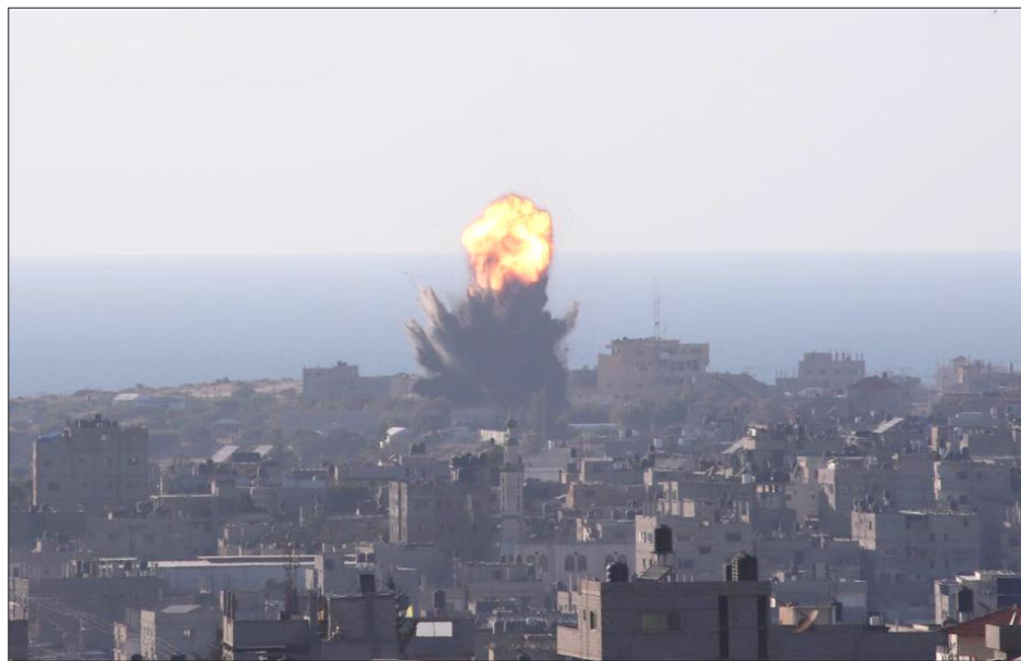
ns following Israeli airstrikes in the southern Gaza Strip city of Rafah

London, May 15 : The corporate scientist discovered the unique adhesive that allowed notes to be easily attached to surfaces and removed. Spencer Silver was the inventor of the adhesive used on one of 3M's best-known products, the Post-it Note. The inventor of the adhesive used on the Post-it Note has died, according to the company 3M, which produces the product, and his published obituary. Spencer Silver was 80 and died May 8 at his home, the family's obituary said. Silver was working in a company lab in 1968 when he discovered a unique adhesive formula, according to 3M. The adhesive allowed notes to be easily attached to surfaces, removed and even re-posted elsewhere without leaving residue like other glues. Silver looked for several years for a practical use for the adhesive, calling it a "solution waiting for a problem to solve". In 1974, his colleague Art Fry came up with the idea of using the adhesive to prevent paper bookmarks from falling out of his hymnal when he sang in church. The product was originally called the Press 'n' Peel memo pad in 1974, but it wasn't brought to the market until 1977 and didn't really take off until 1980, when it was renamed the Post-it Note. It's now one of the top-selling items in 3M's consumer products division. Silver retired as a corporate scientist in 1996 and earned 37 patents during his time at 3M.