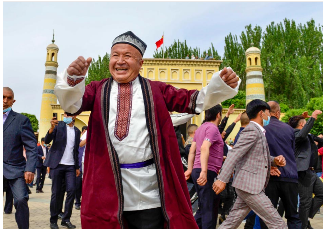
People dancing in front of Id Kah Mosque in Kashgar to celebrate Eid al-Fitr

London, May 15 : Delaying the second dose of the Pfizer/BioNTech or Moderna vaccines as the UK has done can save lives, according to a US modelling study that suggests other countries struggling to immunise their populations could adopt the strategy. Second shots of both vaccines and the Oxford/AstraZeneca jab are designed by the manufacturers to be given within three to four weeks of the first dose. The UK, however, opted for a 12-week delay between doses in a bid to ensure that more people received their first vaccination more quickly. Immunological evidence has shown high protection from one dose - up to around 80% with both Pfizer and Moderna, which are both mRNA vaccines made in a similar way.