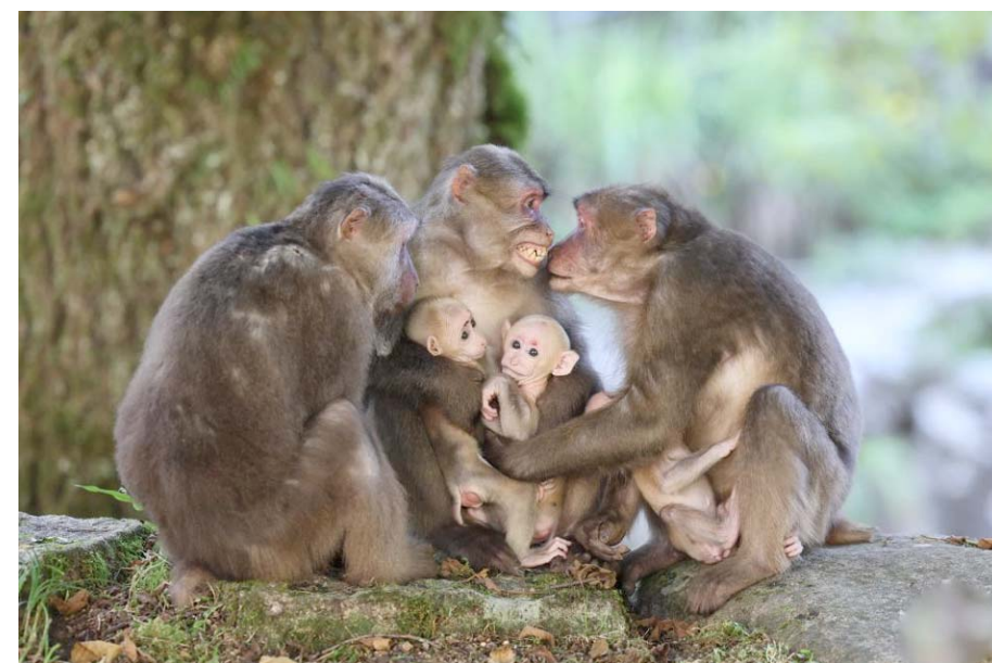
Tibetan macaques are pictured in the Wuyishan National Park, southeast China's Fujian Province

rocky outcrop in 1984, its 40 beds and long wooden tables were entirely in Italian territory. But now two-thirds of the lodge, including most of the beds and the restaurant, is technically perched in southern Switzerland. The issue has come to the fore because the area, which relies on tourism, is located at the top of one of the world's largest ski resorts, with a major new development including a cable car station being constructed a few metres away.