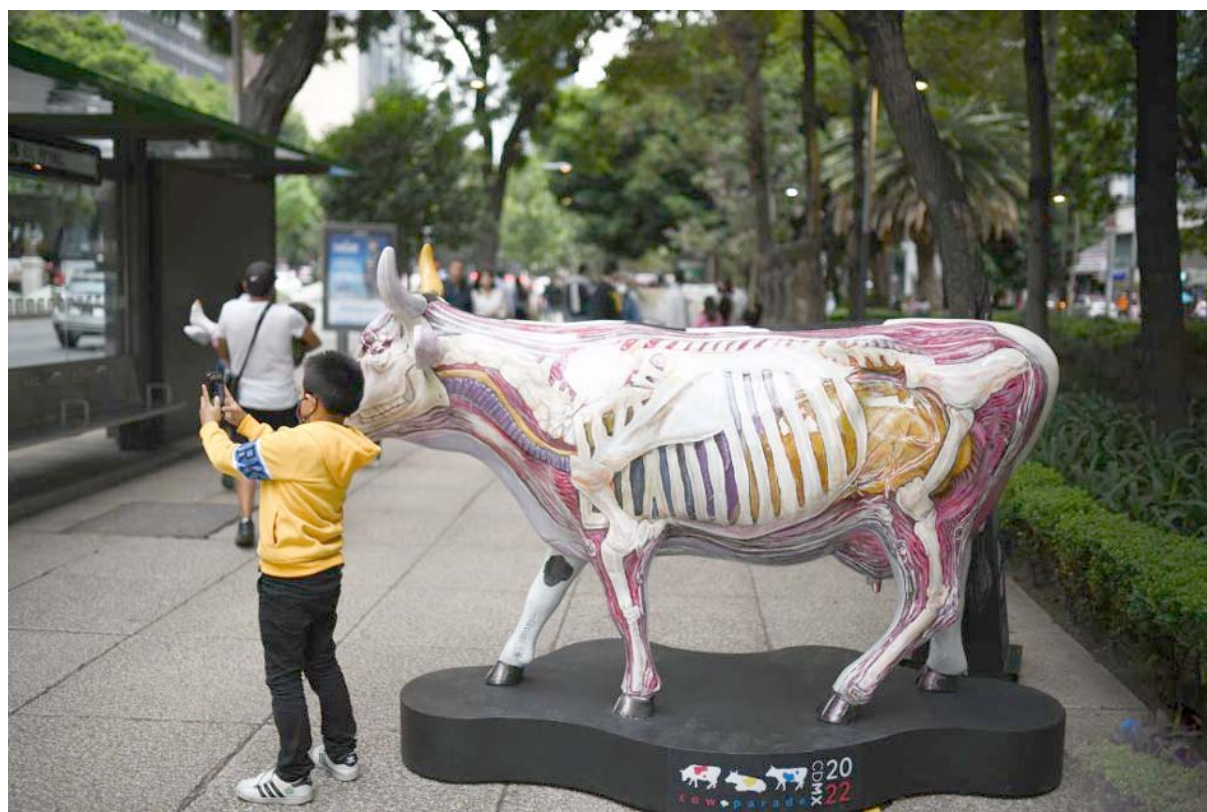
A kid takes a photo with a cow sculpture displayed during the CowParade event in Mexico City