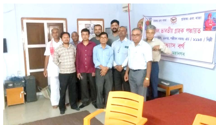
AKHIL BHARATIYA GRAHAK PANCHAYAT, Guwahati Mahanagar Committee organized Abhash Barga at Keshab Dham.

29, 1967 and was renamed as Association of Indian Universities (AIU) in 1973. Since its inception, AIU has been actively engaged in the growth and development of Higher Education. The membership of AIU includes all types of universities, e.g., Conventional Universities, Open Universities, deemed to be Universities, State Universities, Central Universities, Private Universities and Institutes of National Importance. In addition to Indian Universities, 13 Universities/Institutes from Bangladesh, Bhutan, Republic of Kazakhstan, Malaysia, Mauritius, Nepal, Thailand, United Arab Emirates and United Kingdom are its Associate Members.aa