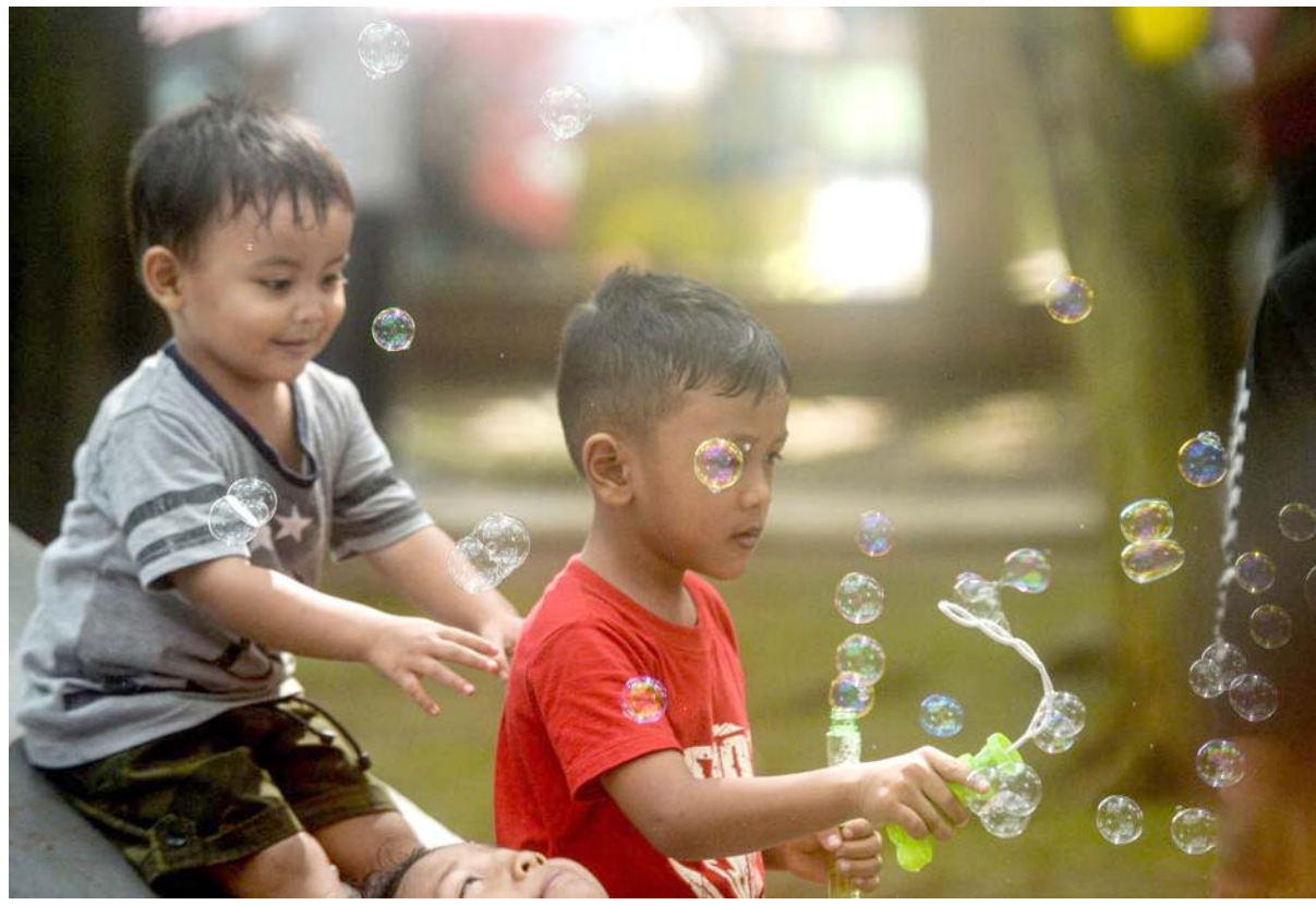
Boys have fun with soap bubbles at the Bumi Serpong Damai City Park in South Tangerang, Banten Province, Indonesia