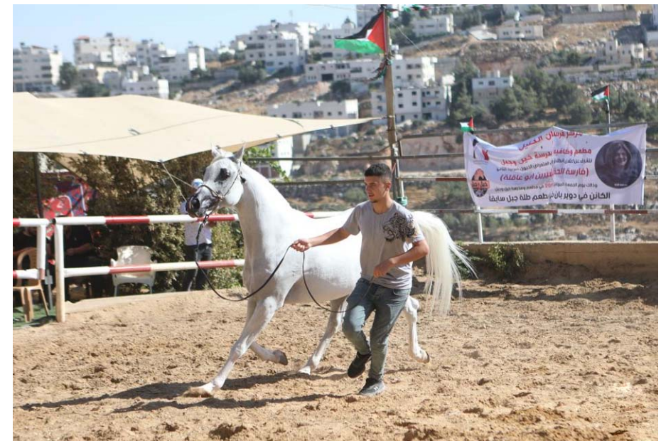
A Palestinian breeder leads an Arabian horse during a beauty contest for Arabian purebred horses in the West Bank city of Hebron

Washington, July 23 : Johnny Depp has filed a notice of appeal one day after his former partner Amber Heard filed her own against the outcome of a multimillion-dollar defamation case.Documents filed on Friday in Fairfax county, in the US state of Virginia, read: "Plaintiff and counterclaim-defendant John C Depp II, by counsel, hereby appeals to the court of appeals of Virginia from all adverse rulings and from the final judgment order of this circuit court entered on June 24, 2022."On Thursday, Heard's legal team submitted a notice that claimed errors made during the trial had prevented a "just and fair verdict" from being returned.