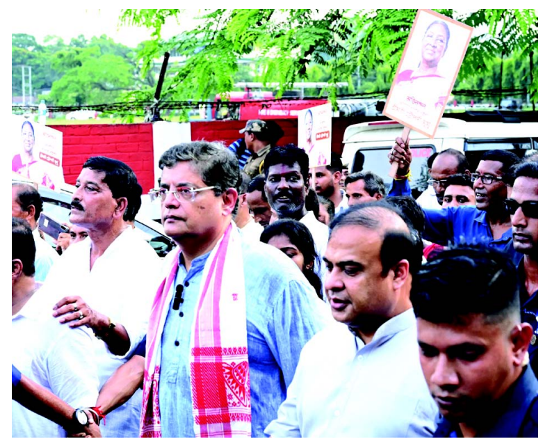
Guwahati- BJP Cultural rally of NDA Presidential candidate Droupadi Murmu On Thursday

Mumbai, July 21 : Uddhav Thackeray, former Chief Minister of Maharashtra, whose MVA government recently collapsed after a rebellion led by Eknath Shinde along with 40 other Sena leaders, is now reaching out to party workers and wings to save Shiv Sena. According to the Times of India, in reaction to the power twist in Maharashtra, Thackeray has sought 50 lakh loyalty affidavits from all the Shiv Sena workers across the country to prove their determination toward the party constitution and its founding father Bal Thackeray. Shiv Sena district heads have been given the responsibility to collect the affidavits from the workers in their respective regions within a few days, the media reports said. As per the media reports, the move aims to prevent Eknath Shinde and his camp to claim control over Shiv Sena, which was founded by his father Bal Thackeray. Thackeray's move came as he lost the Maharashtra Assembly floor test to Eknath Shinde, who is now the chief minister of the state after many of his MPs switched sides. Later, Eknath Shinde claimed that as most Sena MLAs are with him, the real Shiv Sena lies with his faction.