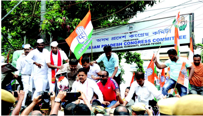
Guwahati- Congress Protest On Thursday