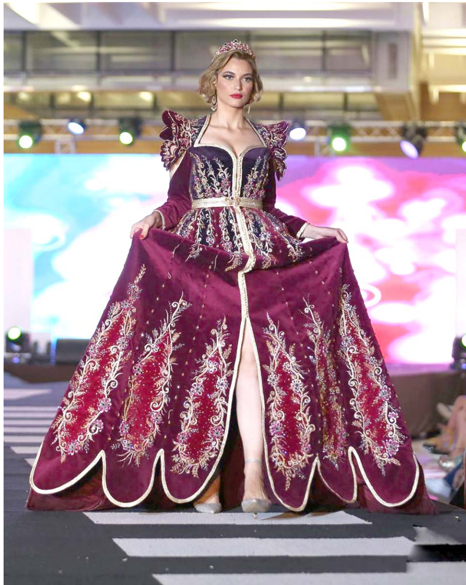
A model presents a creation during a fashion show in Algiers, Algeria