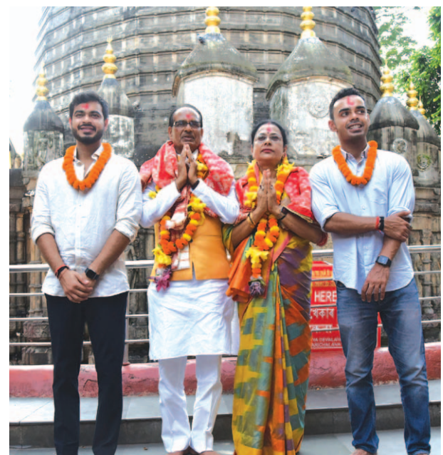
CM Shivraj Singh Chouhan of MP Visited Kamakhya Temple 21 July At Guwahati

above context, a video of a landslide is going viral on social media. While sharing this visual, many media outlets claimed that the viral video is from the recent landslide that took place in Nashik, Maharashtra. Media outlets like Tv9 Bharatvarsh, Zee 24 Taas, inKhabar, Punjab Kesari, and ETV Bharat shared this video with the same claim.