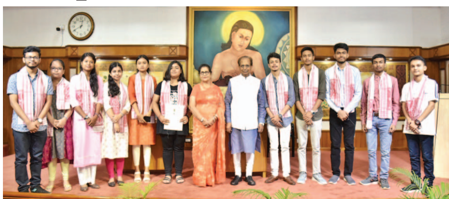
Assam Rising Guwahati, July 02 :

"Students should prepare themselves for the future by instilling in them a sense of nationalism, good moral character and love for the countrymen," said Assam Governor Prof. Jagdish Mukhi at a programme conducted to felicitate the 1st, 2nd and 3rd position holders of HSLC and HSSLC examination 2022 held in Raj Bhavan today. Speaking at the felicitation ceremony, the Governor said, "I am delighted to have felicitated the toppers of the State, who performed exceed-