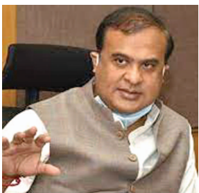
Assam Rising Guwahati, July 02 :

Six people have been identified as responsible for an embankment breach that led to devastating floods in Assam's Silchar, Chief Minister Himanta Biswa Sarma has said during a visit to the Bethukundi dyke. The CM said the accused who allegedly left a gaping hole in the Barak river embankment, more than 3km from the town