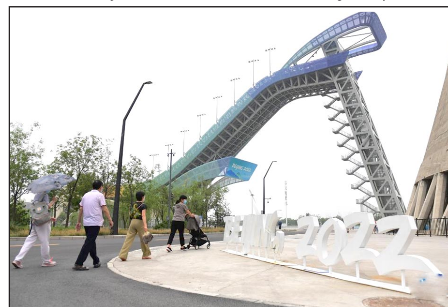
People visit the Big Air Shougang in Beijing, capital of China

is executive chair, did not comment. Hall and Murdoch, who is thought to be worth £14bn, were married at a low-key ceremony in March 2016 at Spencer House in London. Hall has reportedly been left "heartbroken" and "devastated" by the sudden end to their marriage, allegedly blaming his children for "souring the marriage". According to the Daily Mail, she was waiting for Murdoch in the UK when she received an email from him telling her that their marriage was over and that she should only communicate with him through his lawyers.