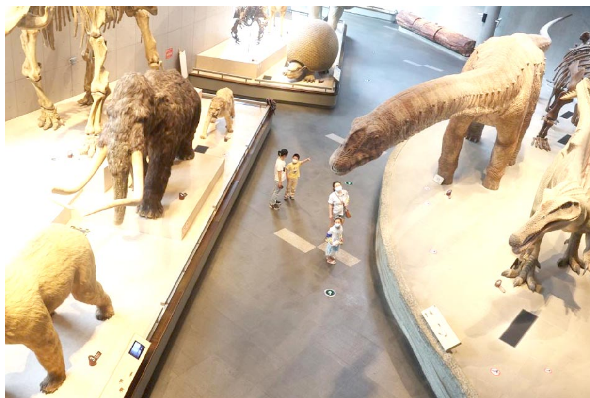
People visit Shanghai Natural History Museum in Shanghai, east China

legislators in the 230-member House. The development paved the way for the return of the saffron party in the state at the helm after a 15-month rule of Congress. The Congress rebels, including their leader Scindia, were later inducted into the BJP. These turncoats contested the assembly by-polls with most of them winning it. Most of these legislators were rewarded with plum portfolios in the Chouhan cabinet, while Scindia was appointed as the Civil Aviation Minister in the reshuffle of the Union cabinet.