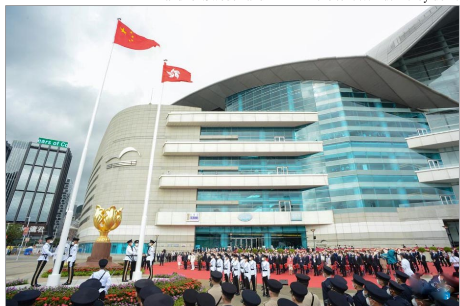
People visit Shanghai Natural History Museum in Shanghai, east China

the second half of 2022. Europe's largest economy joining Canada and California in legalising cannabis for recreational use could create momentum to change the UN convention that restricts the cultivation of the plant and also puts pressure on neighbouring European states to follow Germany's lead. "There will be a domino effect, for sure," said Justus Haucap, director of the Düsseldorf Institute for Competition Economics. "European countries that have a much bigger problem with illegal cannabis use, like France, are watching very closely what Germany is doing at the moment."