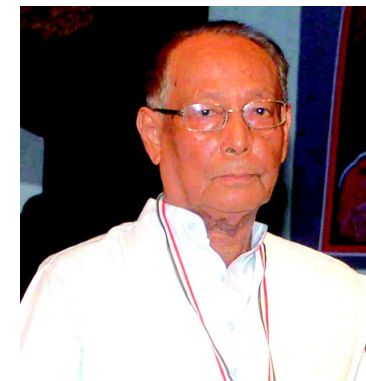
from the GMCH. Homen Borgohain was working as the editor-in-chief of Assamese daily Niyomiya Barta. He was awarded the 1978 Sahitya Akademi Award in Assamese language for his novel Pita Putra. He returned his Sahitya Academy