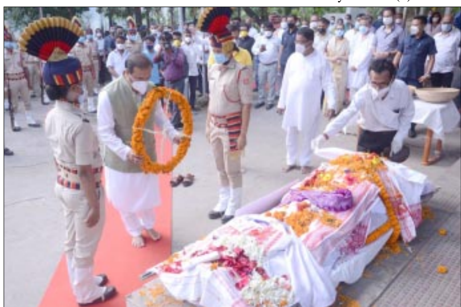
Chief Minister Dr. Himanta Biswa Sarma paying his tributes to eminent litterateur Homen Borgohain at the latter's last rites ceremony at Nabagraha crematorium in Guwahati

Secretary of Assam through the Lakhimpur District Deputy Commissioner today, stating that the Government should supply Covid vaccines in large numbers, and carry out vaccination drive widely in Lakhimpur district to prevent transmission of the virus. It also urged the Government to block the process of online registration for Covid vaccination in Assam, since this process is a complex one which is not acceptable for a state like Assam.