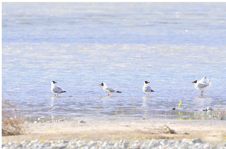
Brown-headed gulls perch near water of Lhasa River in Lhasa, southwest China's Tibet Autonomous Region