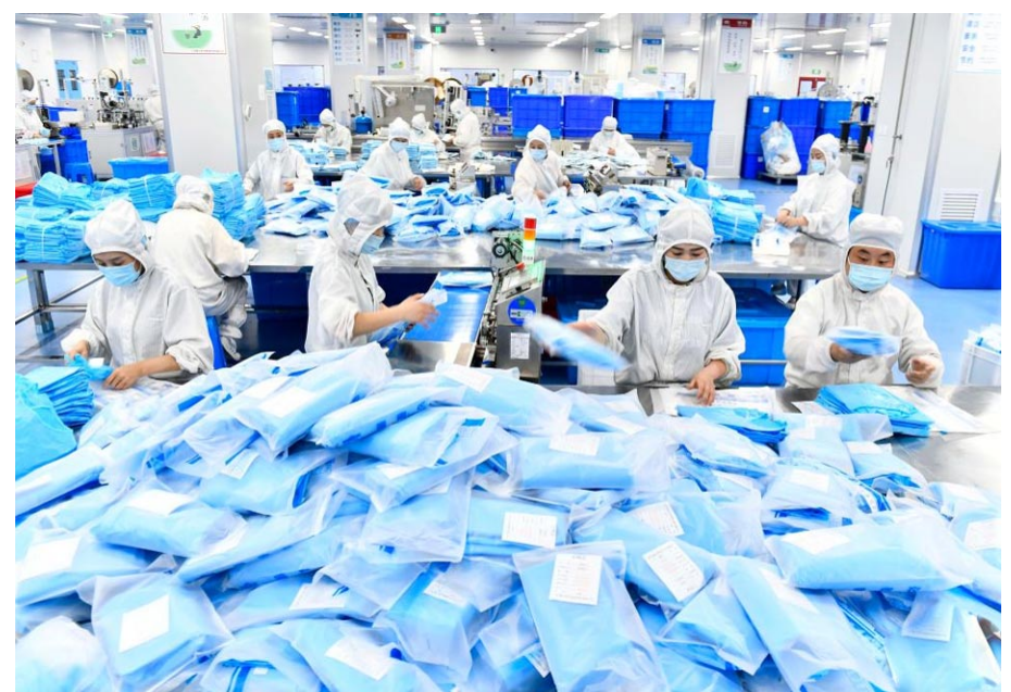
Brown-headed gulls perch near water of Lhasa River in Lhasa, southwest China's Tibet Autonomous Region

152mm shells, it appears that there are now few to be had. The issue has been a defining one in Donbas in recent weeks, where it has been estimated that Russian forces are firing up to 60,000 shells a day in comparison with Ukraine's 5-6,000. Kyiv's troops have increasingly been forced to conserve ammunition. According to some analysts, Russia itself is facing problems with the supply of ammunition, although it has a much larger stock than Ukraine. And while Ukraine's allies in the west have been working to supply systems compatible with Nato shells, the wholesale transformation of Ukraine's military in the midst of a conflict is lagging behind Kyiv's battlefield requirements. Another issue in transitioning to Nato systems is training. While Ukraine is receiving systems such as the M777 155mm howitzer and longer-range multiple-launch rocket systems such as the US-supplied HIMARS, Ukrainian troops need to be trained to use them.