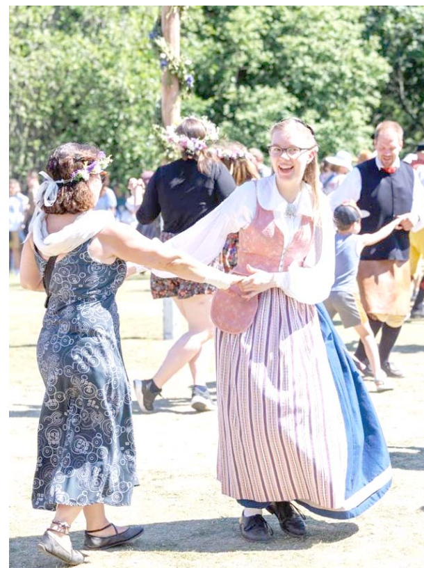
People celebrate the Midsummer Festival in Stockholm, Sweden

and we aren't merging with any other party. Recognition should be given to our faction, if it isn't given, we will go to court and prove our existence and numbers. We have numbers, but we respect CM Uddhav Thackeray, we won't speak against him. We must follow the path on which we fought Assembly elections," he added. Notably, Eknath Shinde was unanimously elected as the leader of the faction recently which is revolting against the Uddhav faction. The Uddhav Thackeray faction recently submitted a plea before the Maharashtra Assembly deputy speaker to disqualify 12 rebel MLAs.