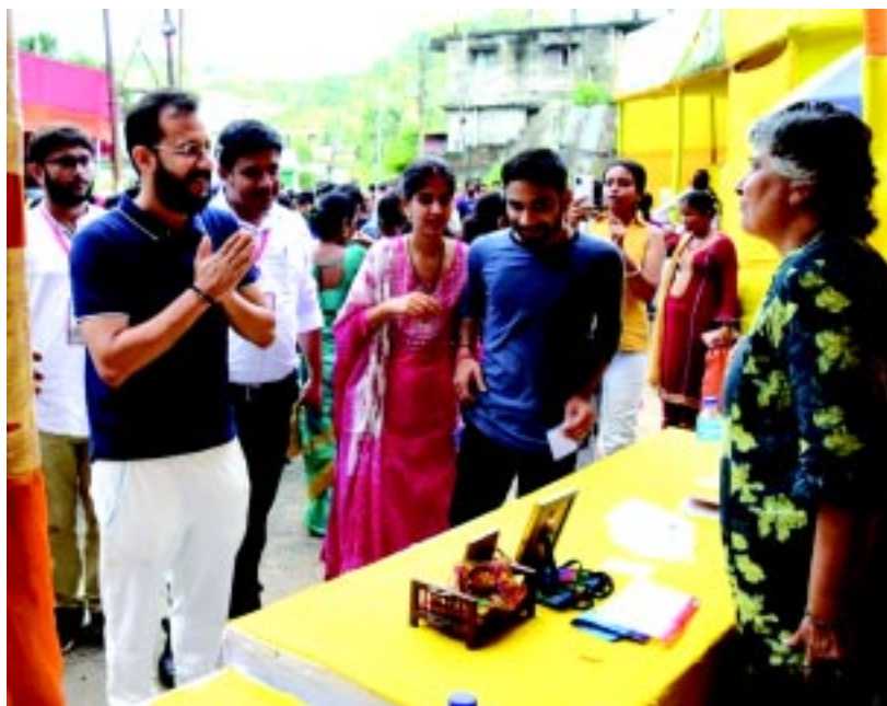
Guwahati- DC walks on his way to the Kamakhya temple

"PM Modi said." During the sessions of the Summit, I will be exchanging views with the G7 counties, G7 partner countries and guest International Organisations on topical issues such as environment, energy, climate, food security, health, counter-terrorism, gender equality and democracy," PM Modi added. "During the Summit, Prime Minister Modi is expected to speak in two sessions that include environment, energy, climate, food security, health, gender equality and democracy. In an effort to strengthen international collaboration on these important issues, other democracies such as Argentina, Indonesia, Senegal and South Africa have also been invited," MEA said in a statement. After attending the G7 Summit, Prime Minister will be travelling to United Arab Emirates (UAE) on June 28, 2022, to pay his personal condolences on the passing away of Sheikh Khalifa bin Zayed Al Nahyan, the former UAE President and Abu Dhabi Ruler. The Ministry statement added, "PM Modi will also take the opportunity to congratulate Sheikh Mohamed bin Zayed Al Nahyan on his election as the new President of UAE and Ruler of Abu Dhabi."