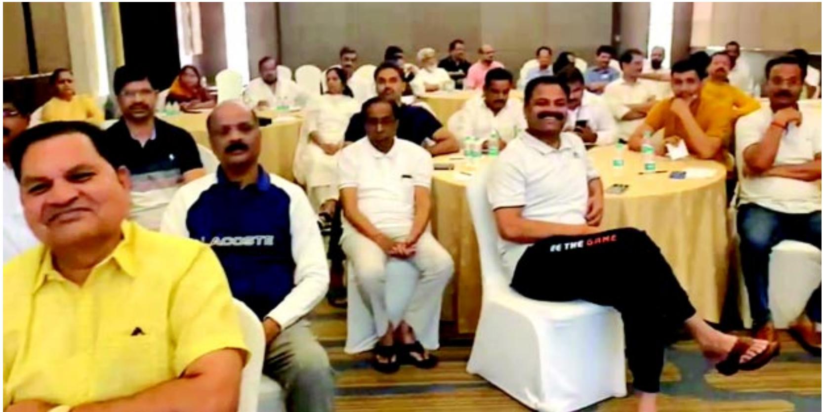
Guwahati- Maharashtra MLAs meeting