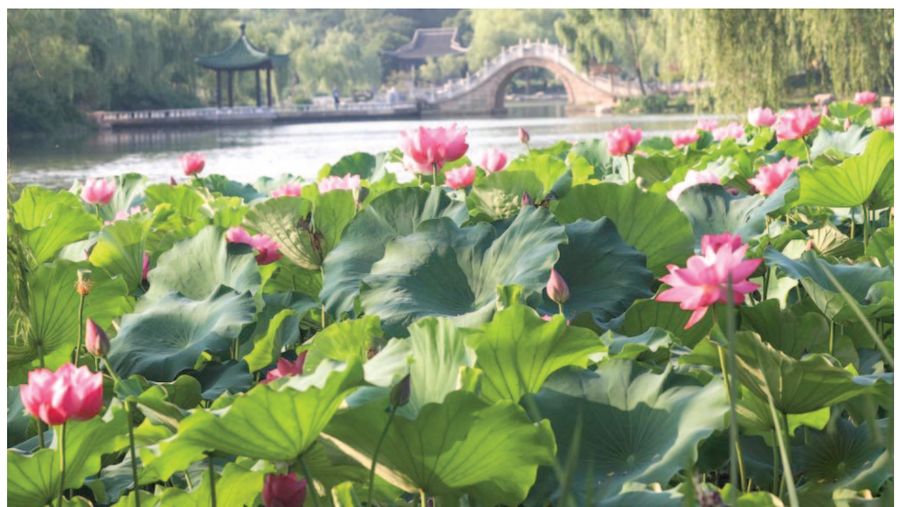
hows lotus flowers in the Slender West Lake scenic spot in Yangzhou

said. He said more than 40 countries were now facing food inflation of over 15%, and upwards of 30 economies had seen depreciation of their currency of more than 25%. "The numbers do not lie. Pre-Covid we were looking at about 135 million people in crisis or the worst type of food security situation. Today, including Ukraine's impact, that number is 345 million. There are about 50 million people in the world who are what we call in hunger emergencies, meaning one step away from famine. That is not in one, two or five countries, but upwards of 45 countries. That's the magnitude, that's the scale of the problem you're talking about."