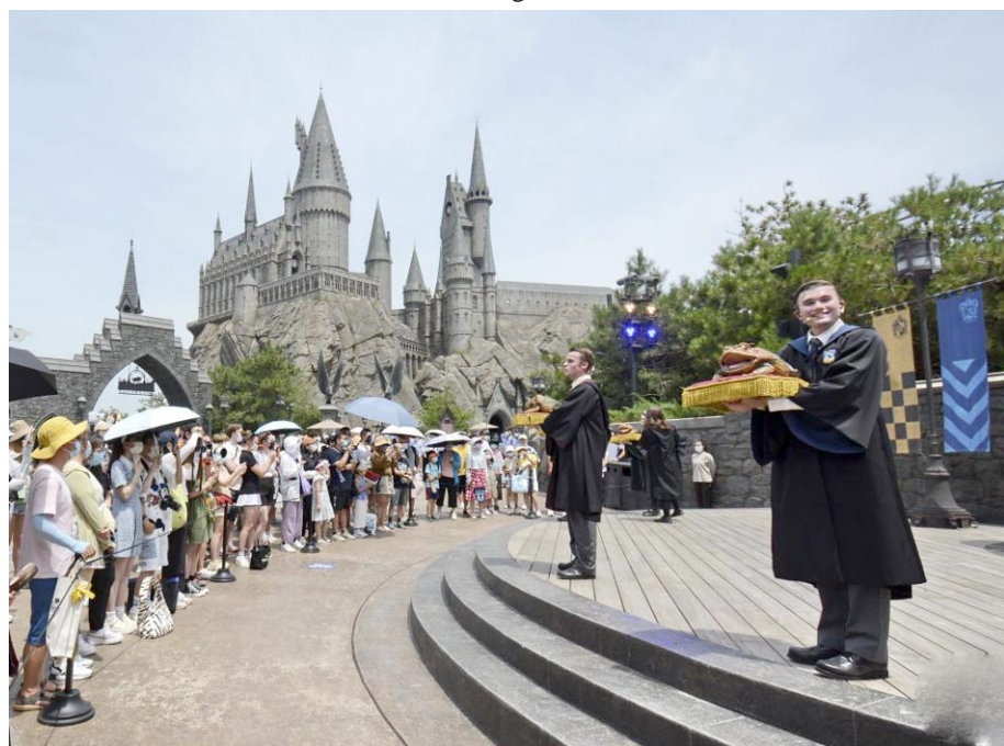
Tourists watch a show at the Universal Beijing Resort in Beijing, capital of China

A/C Non A/C Rooms with Car Parking At POGL Brahmaputra, Chandmari, Guwahati-21 Ph. WA : 9678009493/ 9707183470