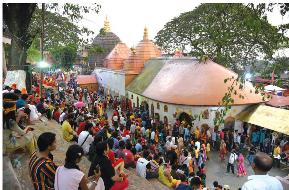
Guwahati- Ambubachi Mela