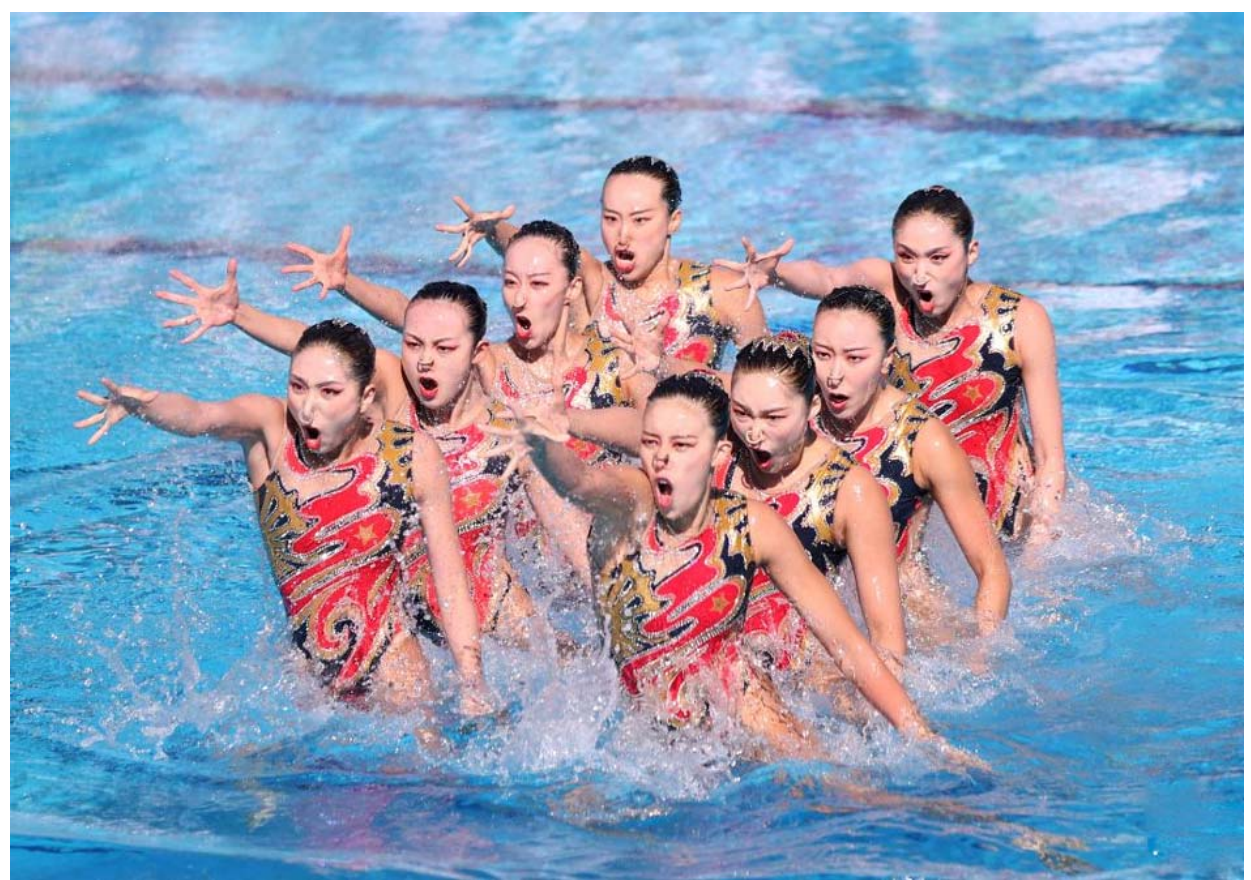
Team China perform during the Artistic Swimming Women's Team Technical Final of the 19th FINA World Championships in Budapest, Hungary

for the right to freedom of assembly and association, opinion and expression, and participation in government were also all "very bad", with average scores of 2.5. The scores were 4 or above in 2019. The survey found the right to freedom from arbitrary arrest in Hong Kong was in the lowest "very bad" range, with a score of 3.5 out of 10. The risk of torture and ill treatment was also considered high, falling in the "bad" range at 5.5. The human rights experts surveyed said those most at risk were protesters, political activists, people with "particular political affiliations or beliefs" and human rights advocates. However, the fifth most cited group was "all people", with respondents making specific mention of the 60 or so civil society and labour organisations and media outlets that had