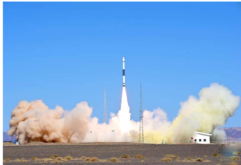
A Kuaizhou-1A carrier rocket carrying the Tianxing-1 test satellite blasts off from the Jiuquan Satellite Launch Center in northwest China