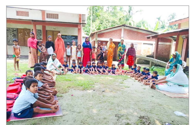
International Day Of Yoga 2022 observed at various AWCs &amp; Relief camps in Barpeta

protest programme. Congress leader Alleged that the Central BJP led government has committed mental torture against Congress leader Rahul Gandhi through ED. Congress workers staged a massive protest with anti-government slogans. Margherita Block Congress president Tara prasad Dihingia led the protest programme.