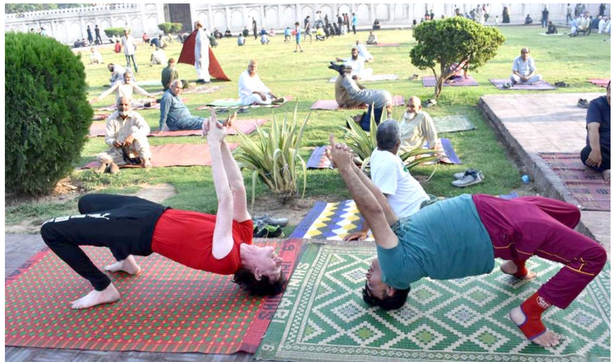
Participants take part in a yoga performance in Lahore, Pakistan

associated with an 84% heightened risk of death from any cause. The researchers said the study had limitations, including that the participants were all white Brazilians, which means the findings may not be more widely applicable to other ethnicities and nations. Nevertheless, the researchers concluded that the 10-second balance test "provides rapid and objective feedback for the patient and health professionals regarding static balance" and "adds useful information regarding mortality risk in middle-aged and older men and women".