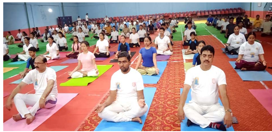
International Yoga Day observed in North Lakhimpur on June 21.