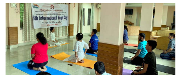
tion of the Ministry of Skill Development and Entrepreneurship, Government of India observed 8th In-

Assam Rising Guwahati, June 21: Yoga is an invaluable gift of ancient Indian tradition which embodies unity of mind and body; thought and action, restraint and fulfilment, harmony between man and nature and a holistic approach to health and well-being. Under the initiative of Prime Minister Narendra Modi, the United Nation declared the 21st June as International Day of Yoga. With the theme "Yoga for Humanity" for the year 2022, the Indian Institute of Entrepreneurship (IIE) an autonomous organiza-