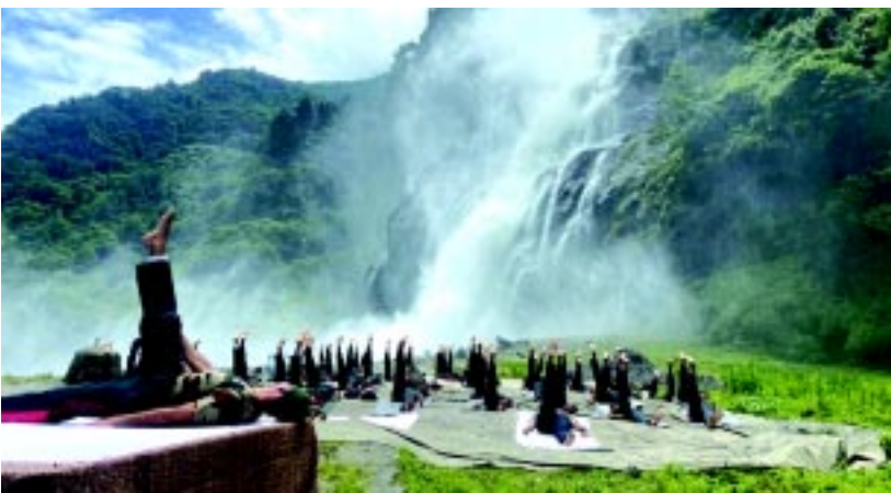
Arunachal- Army celebrated International Yoga Day