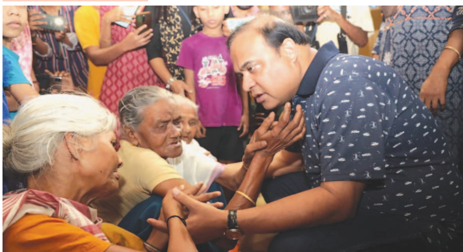
CM Dr. Himanta Biswa Sarma is visiting flood affected areas of Nalbari & Kamrup district on June 21.