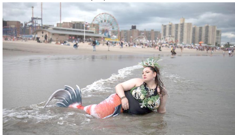
A woman wears mermaid fins in the sea after the 2022 Mermaid Parade at Coney Island in New York

grouping in the lower house of parliament in order to have a free hand for his proposals to cut taxes and make changes to the welfare system. Pollsters have been unable to predict whether Macron will cling to a majority in what is likely to be a record low turnout. All polling firms predict that Macron's centrist alliance, Ensemble, will be the biggest grouping in parliament, but it could fall short of the 289 seats needed for a majority. Final polls this week suggested it would take between 255 and 305 seats in the 577-seat house.