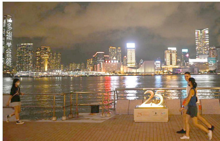
People walk past a celebratory decoration illuminated for the 25th anniversary of Hong Kong's return to the motherland in Hong Kong