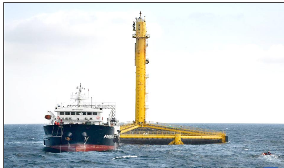
A salmon processing vessel harvests Atlantic salmon near Deep Blue No. 1 at a fish farming experimental area of Qingdao, east China's Shandong Province.

has been asked to help other disaster response agencies rescue stranded people and provide food and essentials to those whose houses are submerged under flood waters. "We are using speedboats and inflatable rafts to rescue flood-hit people," an army official said. In Bangladesh, districts near the Indian border have been worst affected. Water levels in all major rivers across the country were rising, according to the flood forecasting and warning centre in Dhaka, the capital. The country has about 130 rivers. The centre said the flood situation was likely to deteriorate in the worst-hit Sunamganj and Sylhet districts in the north-eastern region as well as in Lalmonirhat, Kurigram, Nilphamari and Rangpur districts in northern Bangladesh.