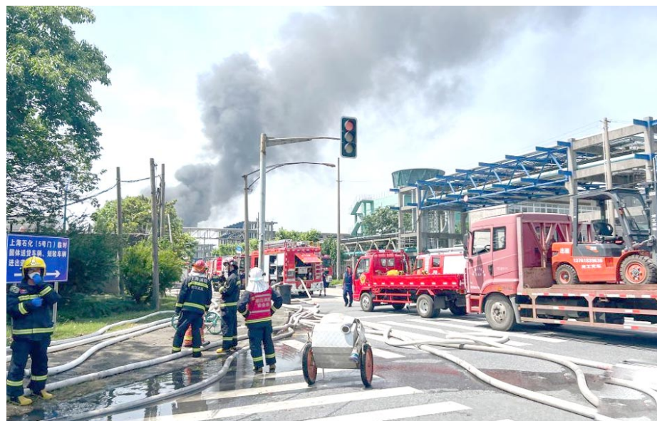
Firefighters work at the fire site at the ethylene glycol plant area of Sinopec Shanghai Petrochemical Co., Ltd. in east China's Shanghai

lives". Thursday's shooting happened just over a month after one person was killed and five injured when a man opened fire on Taiwanese parishioners at a Southern California church. It also came nearly seven years to the day after an avowed white supremacist killed nine people during Bible study at Emanuel AME Church in Charleston, South Carolina. A message posted by St Stephens said it would hold Sunday services, adding: "We will gather at the table that has taught so many that love is always breaking through in this world, no matter what we experience, whether it be doubt, anger, loss, grief, or death but yet also joy and life."