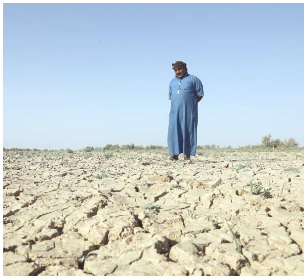
A farmer stands in the middle of his farm, which looks cracked as a result of drought and water scarcity, in Salahudin province, Iraq.

back for land that coastal erosion has taken away or which a rising sea level has put permanently or frequently under water." He added: "In some places the right answer - in economic, strategic and human terms - will have to be to move communities away from danger rather than to try and protect them from the inevitable impacts of a rising sea level." Previous estimates of the number of homes at risk were lower, as government estimates have not kept up with climate science. In 2018, the Committee on Climate Change warned that about a third of the UK coastline was in danger.