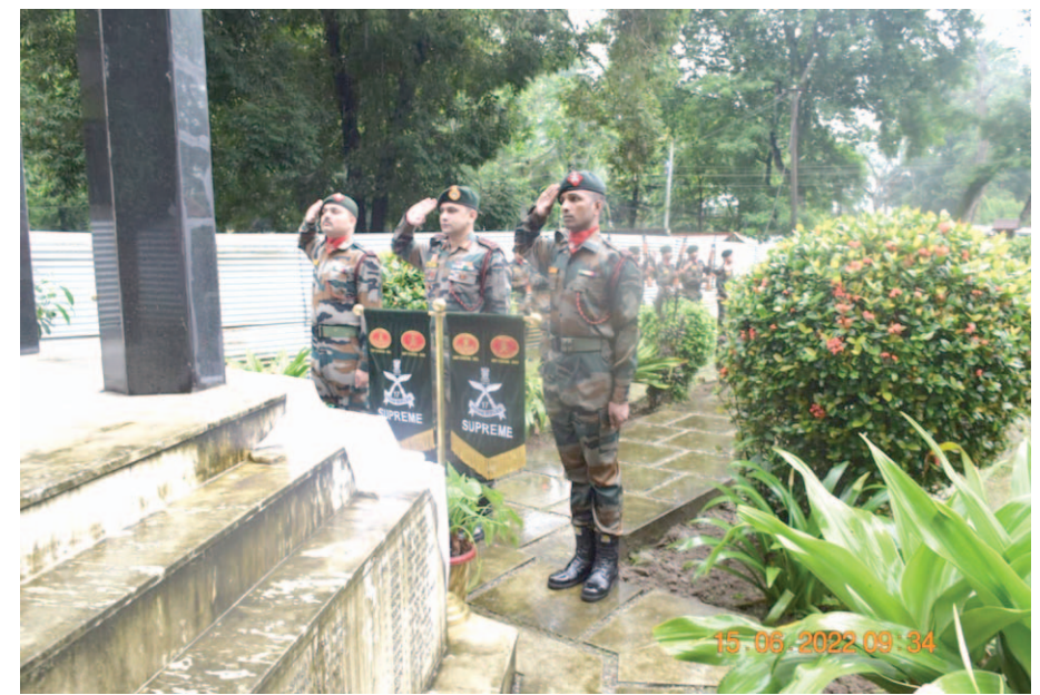
Lokra Battalion, Assam Rifles Honouring its Braveheart on June 15.

struction of the university buildings, he has suggested completing the construction works within the stipulated times. The meeting was attended by the Deputy Commissioner, Additional Deputy Commissioner, Circle Officer, Block Dev. Officer, D.D.O etc., Members of the Srimanta Sankaradeva Sangha, Registrar along with the officials of the University.