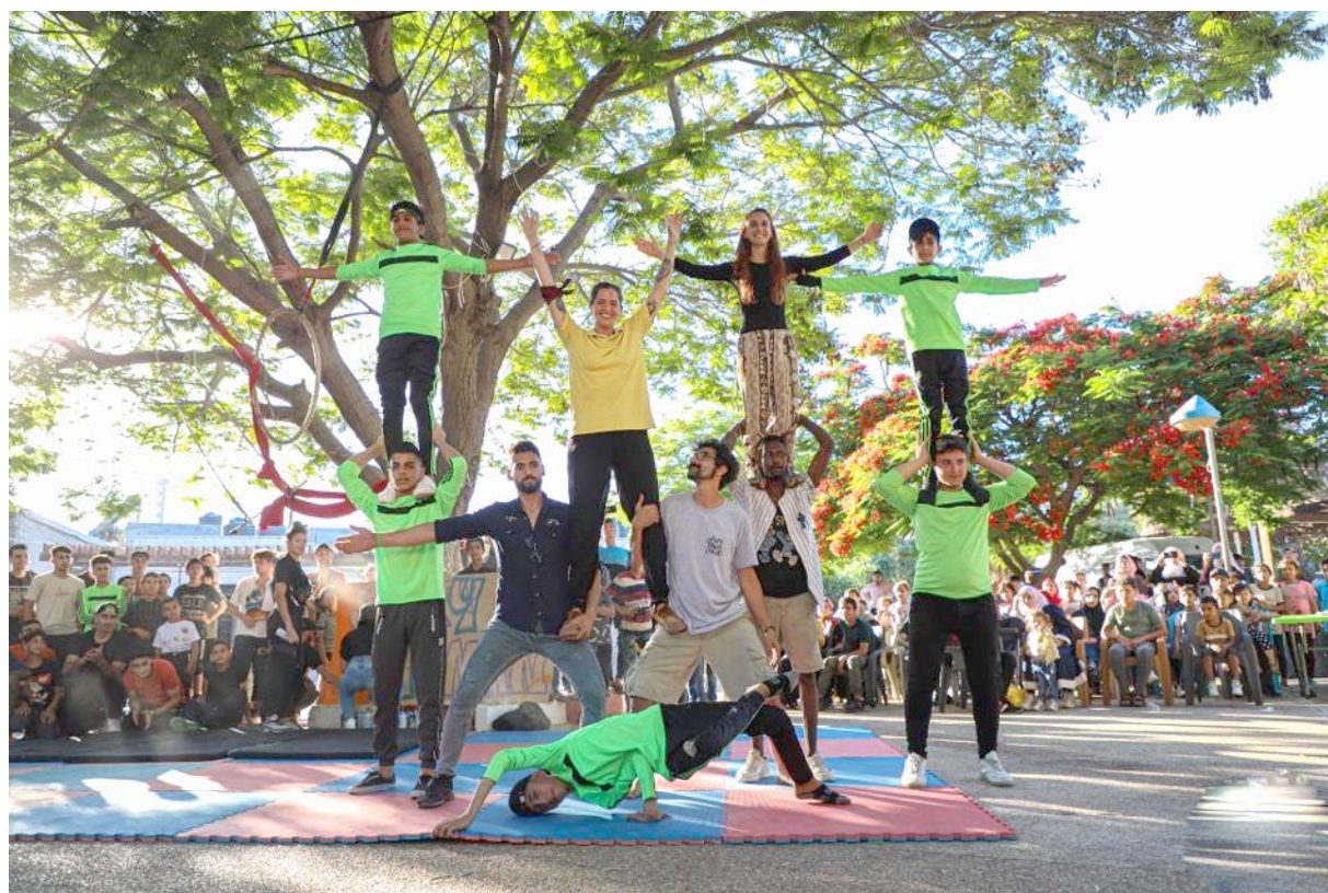
Palestinian youths and members of Italian artistic delegation preform during a festival called The Circus and Dabke Festiva which is organized by the Gaza Municipality, in Gaza City