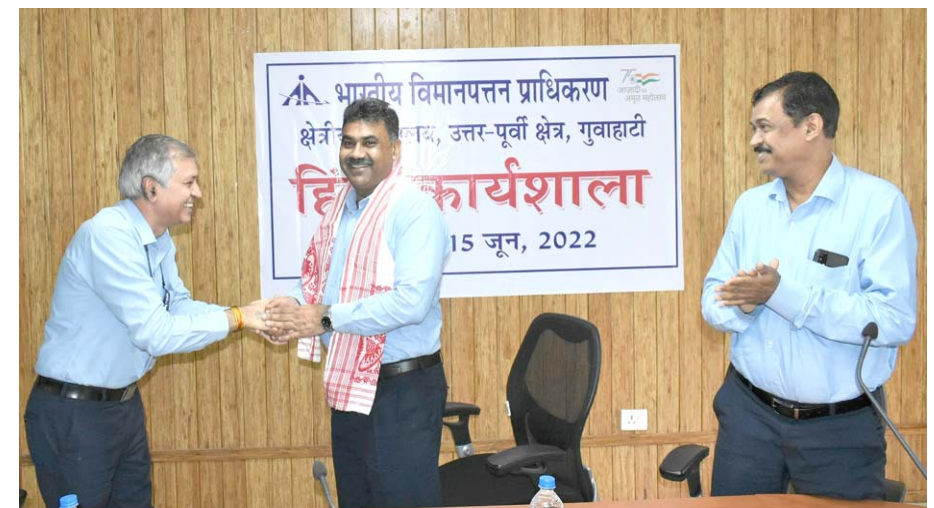
NFR organized a Hindi workshop at Regional HQ of NE on June 15.