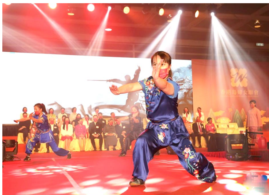
Chinese Kung Fu (Chinese martial arts) performance during an event under the theme of traditional Chinese culture in Hong Kong, south China