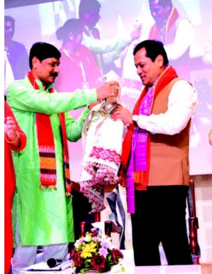
Diphu- BJP State Executive meeting