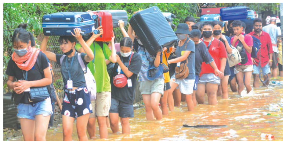
Guwahati- students leave hostel due 2 flood