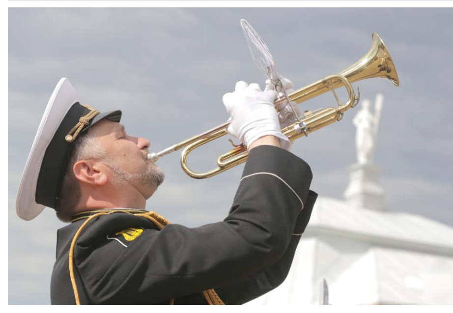
A member of a military band performs during a celebration for the Russia Day in St. Petersburg