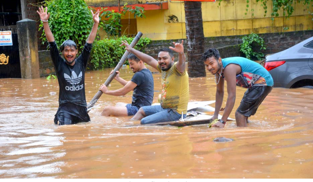
Guwahati- flood anil nagar

told .According to him, over the years since 1951, the Muslim population is declining in India. He said that Muslims have not come back since they moved to Pakistan. "Only non-Muslims have come due to religious persecution. If there are, the government is strong