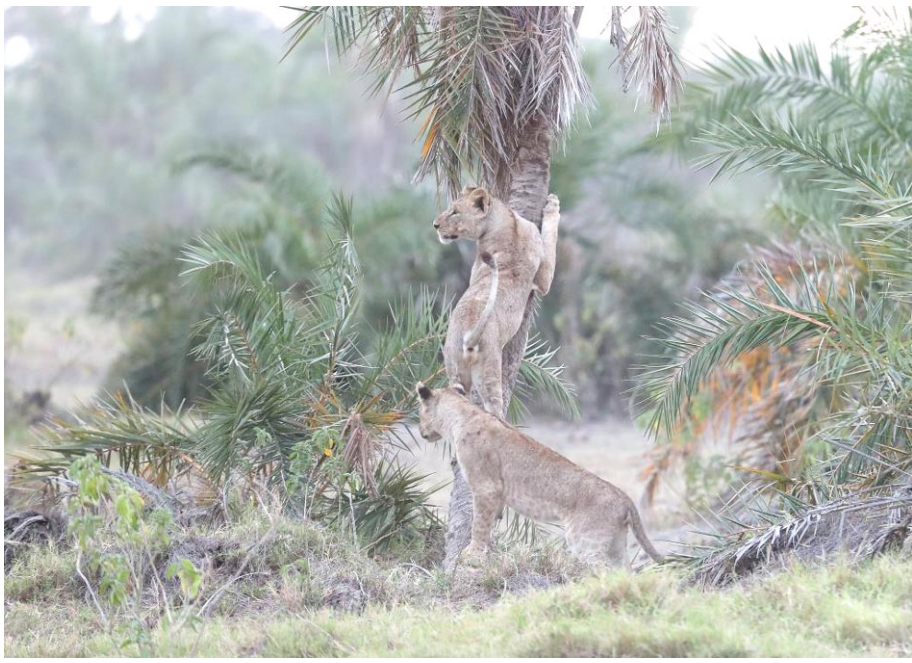
Shows lions at the Amboseli national park, Kenya