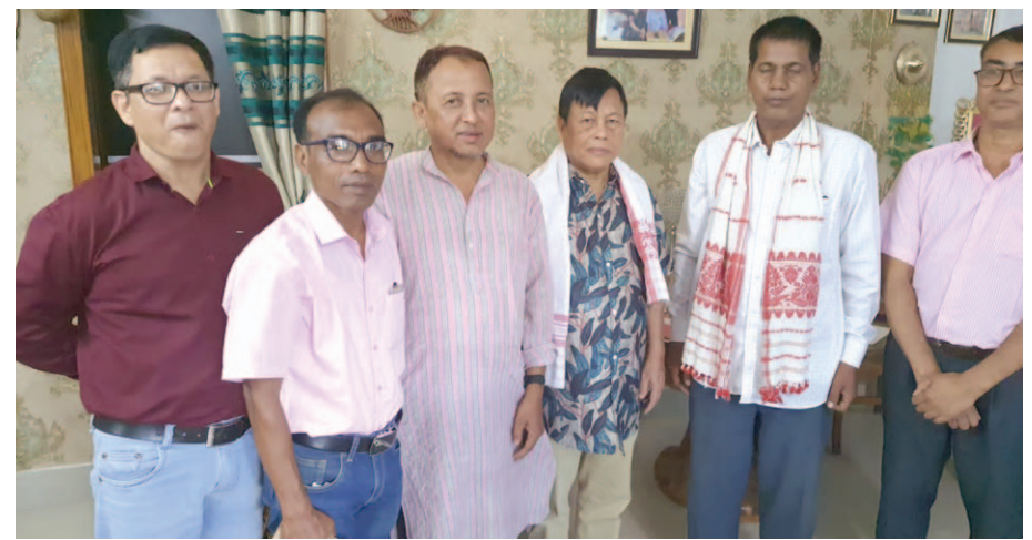
Central committee members of Assam state OBC federation at Guwahati on June 13.

lowed by engaging discussions among resource persons, faculty members and participants. The workshop concluded with a remark that digital sociology and digital ethnography as methods of research have to be applied for exploring the issues of the present advanced industrial era.