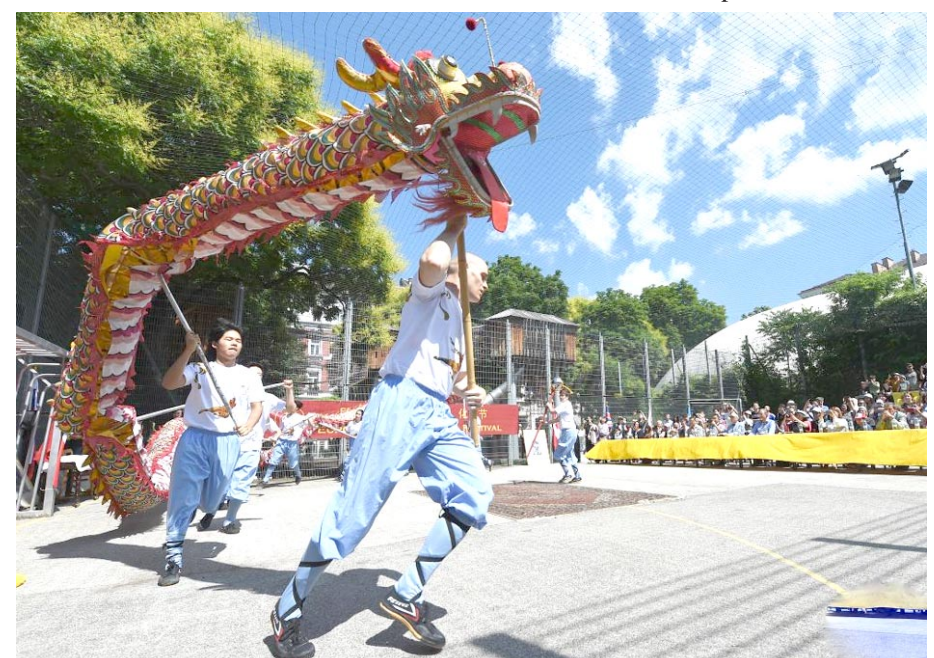
A dragon dance is performed during a Shaolin cultural festival in Vienna, Austria

asked questions and as standard practice included a deadline for a response". The ABC radio host Rafael Epstein called that "disingenuous".