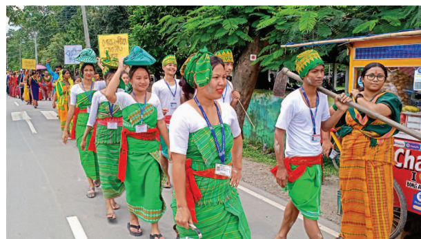
Bongaigaon- Cultural rally of Annual College Week