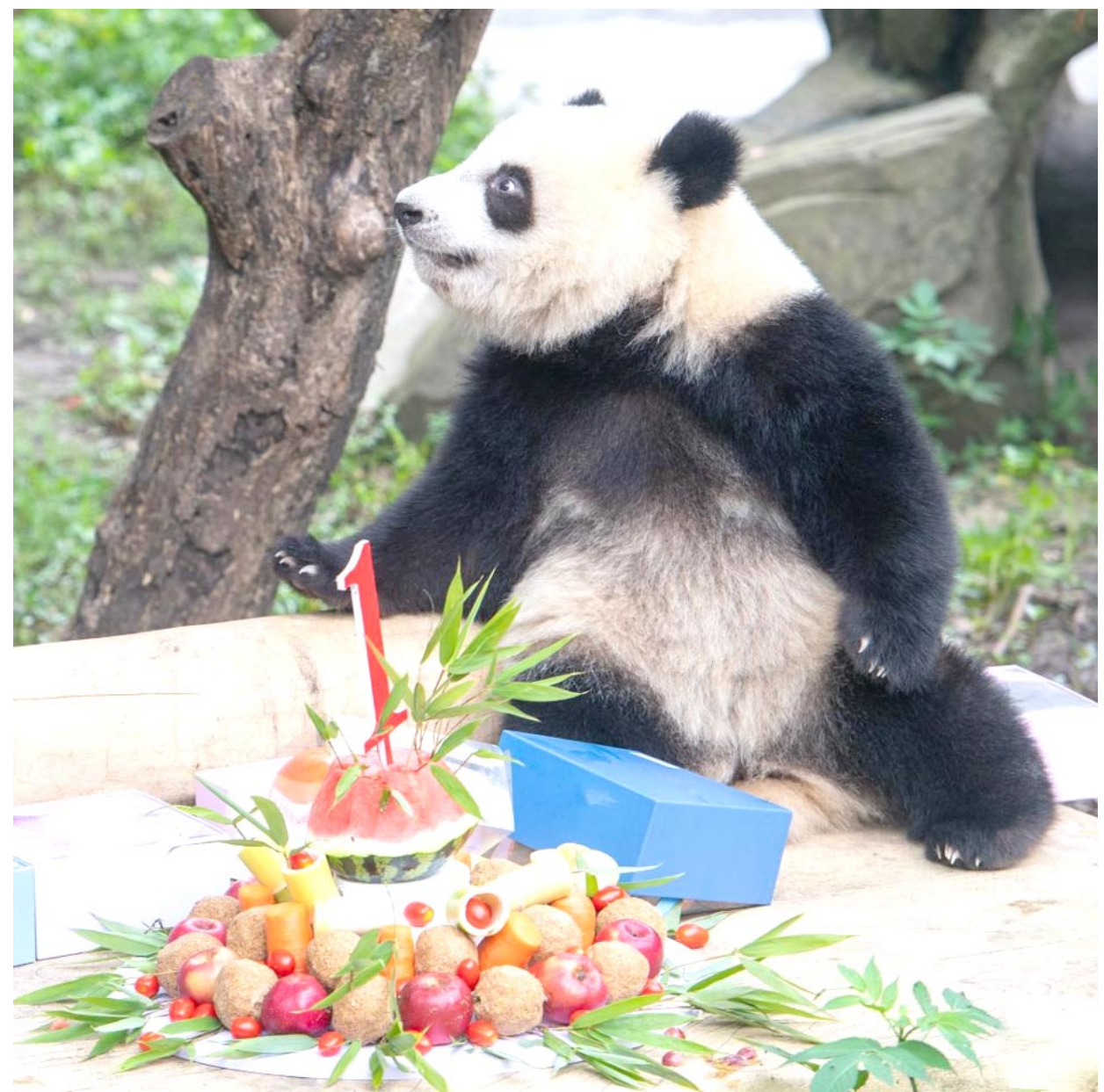
A giant panda plays during a birthday party at the Chongqing Zoo in southwest China's Chongqing Municipality

London, June 11 : Prince Charles has privately criticised the government's policy of deporting migrants to Rwanda, calling the practice "appalling". The