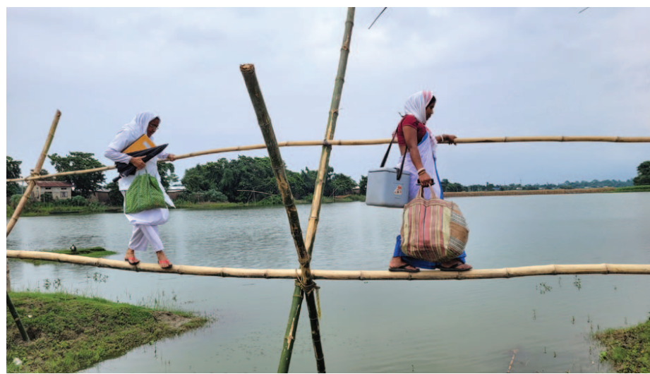
Morigaon- Health worker's vaccinated in remote area