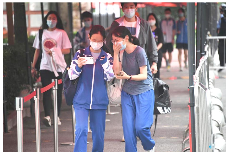
Examinees leave an exam site at Beijing Zhongguancun High School in Beijing

was forged by the new Labor government just three weeks after the federal election. Albanese confirmed it was not reached before the election by the former government and kept confidential. The total cost of the failed submarine project for Australian taxpayers is $3.4bn, which is down from the $5.5bn touted as the government's total approved budget for the project. As Guardian Australia has previously reported, officials had considered this to be a maximum "envelope".