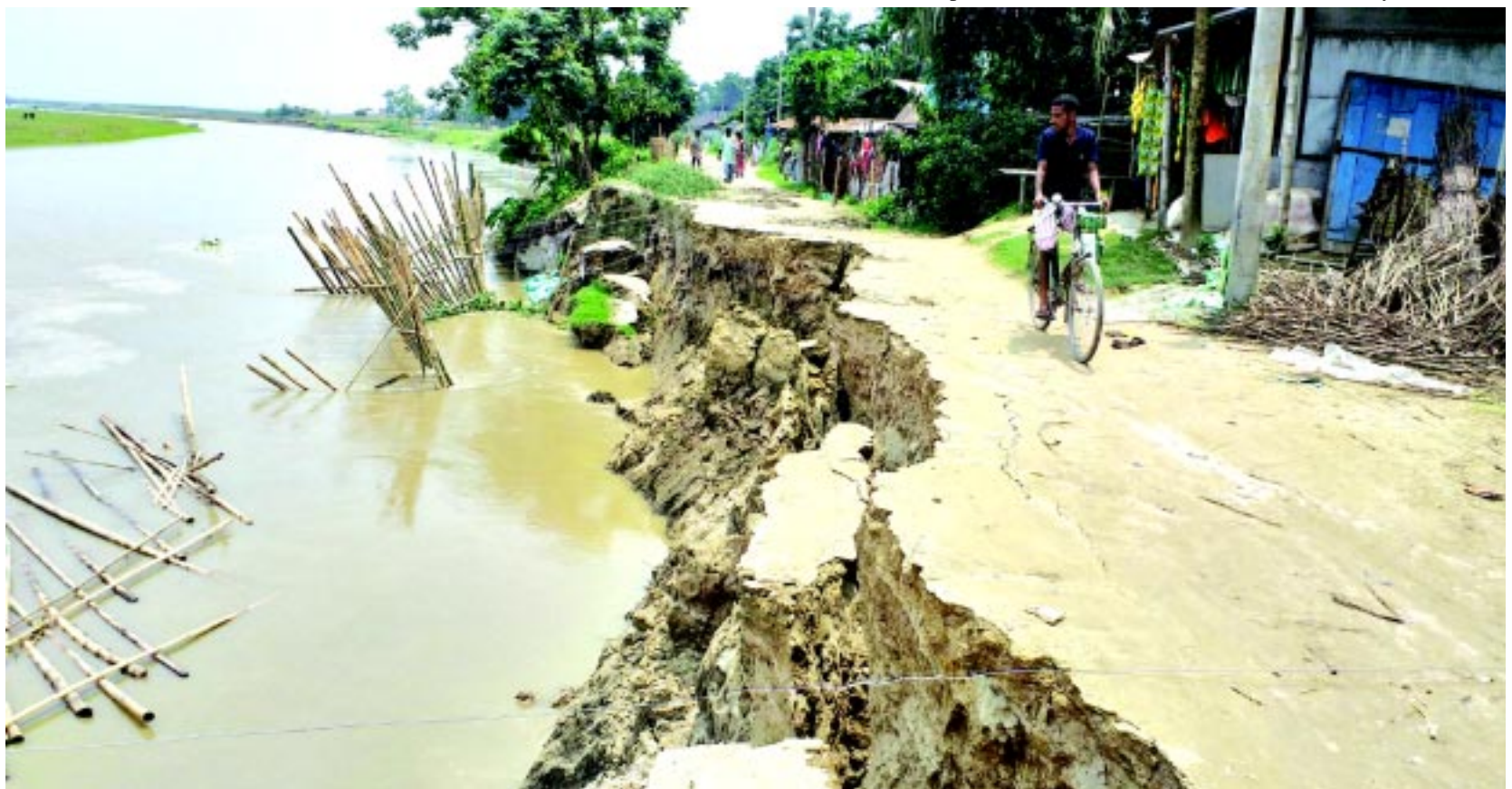
Mangaldai- Massive Soil erosion

Guwahati, June 09 : Assam Higher Secondary Education Council (AHSEC) has requested all the institutions that come under the council to promote all HS 1st year students who were unable to appear for the examinations due to the unprecedented natural calamities during the exam schedule."This is to request to all the Head of the institutions under AHSEC, to promote all the students to HS 2nd year, who had appeared partially or completely or filled up Examination form but not appeared in the examinations, keeping in view the unanticipated natural calamities occurred during the examination schedule and other factors," an official notification by AHSEC stated on Thursday.It has also asked the institutions to "upload the marks of students through the portal so as to issue Mark-sheet to the students for their future use."Earlier in May, AHSEC had announced that the HS first year examinations were postponed due to floods and landslides that disrupted normal life in the state. The examinations that were supposed to be held from May 18 to May 21 but were later postponed to June.