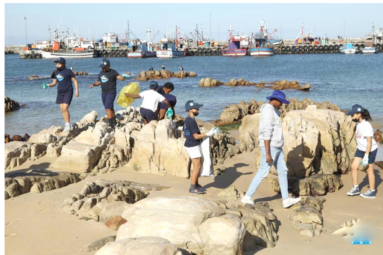
Locals attend a beach cleanup to mark World Oceans Day at Kalk Bay, Cape Town, South Africa