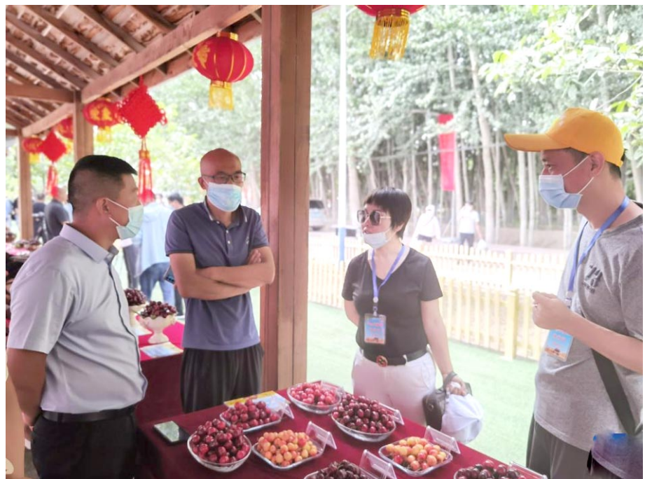
Locals attend a beach cleanup to mark World Oceans Day at Kalk Bay, Cape Town, South Africa

A/C Non A/C Rooms with Car Parking At POGI, Brahmaputra, Chandmari, Guwahati-21 Ph. WA : 9678009493/9707183470