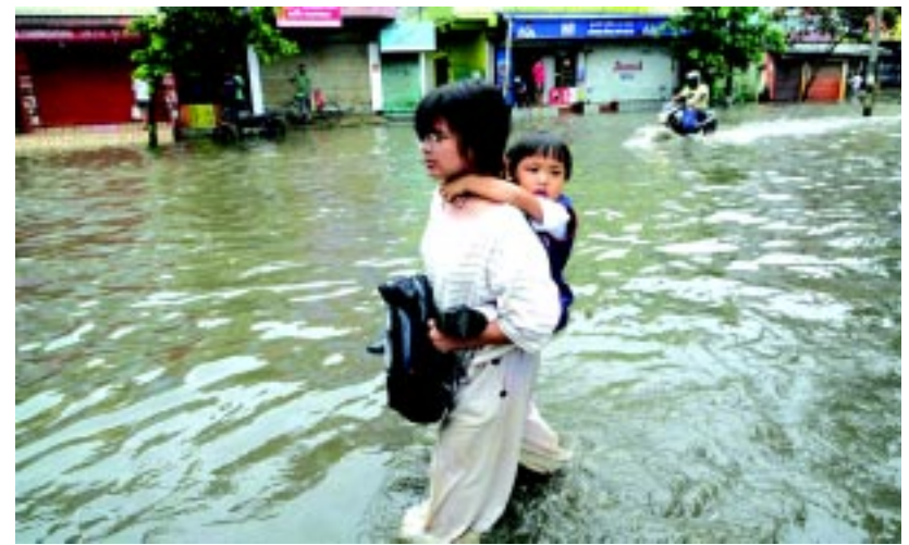
Guwahati- Watterlooding at Hatigaon area