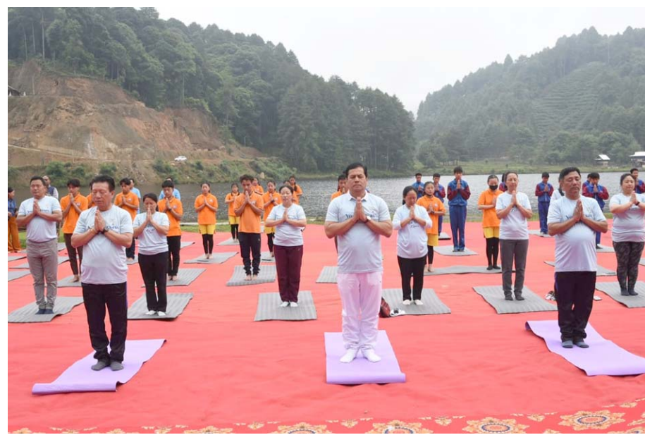
Arunachal- Union Minister Sarbananda participated Yoga