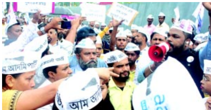
Guwahati- AAP Protest