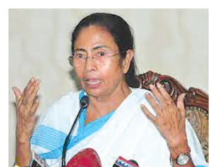
Bengal, Mamata Banerjee held a meeting in

He said, "I am telling Mamata Banerjee, dare not set foot in Koch Kamtapur. You cannot interfere or oppose the formation of Koch Kamtapur." On the second day of her visit to North