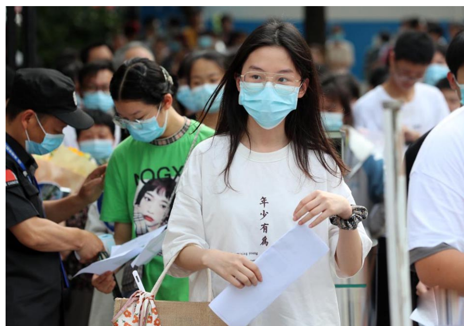
Students go to their examination site to get familiar with the environment ahead of the national college entrance exam in Hengyang, central China's Hunan Province

London, June 07 : Fast-food chain temporarily changes recipe due to supply chain issues caused by floods in Queensland and northern NSW earlier this year. Iceberg lettuce on sale for $8.99 in Melbourne. KFC has started using cabbage because of the shortage of iceberg lettuces. If you've noticed a twist in your Twister, or a bit more zing in your Zinger, it could be that Australia's lettuce shortage is starting to bite. KFC has advised customers that they are temporarily using a blend of lettuce and cabbage in stores in Victoria, NSW, Queensland, the ACT and Tasmania because of supply issues across the country. "We've hit a bit of an Iceberg and are currently experiencing some lettuce supply chain disruptions due to the impacts of the recent Queensland and NSW floods," the fast-food chain posted online. Those who don't fancy cabbage can remove all greenery from their food instead. KFC said late last month, by using the customise option when ordering online. Iceberg lettuces, the variety favoured by fast food outlets, have hit prices as high as $12 each in some supermarkets. In Queensland's Lockyer Valley, some lettuce farmers have lost three crops in a row, the ABC reported. KFC has not said how long the shortfall will last but an AusVeg spokesperson told Guardian Australia last week it could be some time before prices drop.