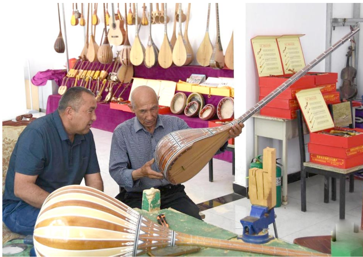
Craftsmen discuss the making of an instrument at a traditional musical instrument atelier in village of Towanki-ogusak in Kashgar Prefecture, northwest China