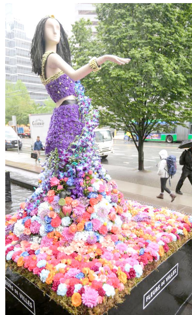
A mannequin decorated with flowers is displayed on a street in Vancouver, British Columbia, Canada

Chief Minister @myogiadityanathji. Under the guidance of Modi Ji, the way you have given development-oriented government to Uttar Pradesh by freeing it from goonda raj and mafia raj, the state is making new records of progress. I pray to God that you stay healthy and live longer." Union Defence Minister Rajnath Singh greeted the UP Chief Minister and said that he is working tirelessly for the state with a dedicated spirit. "Happy Birthday to the Chief Minister @myogiadityanathji, who is engaged with full strength and