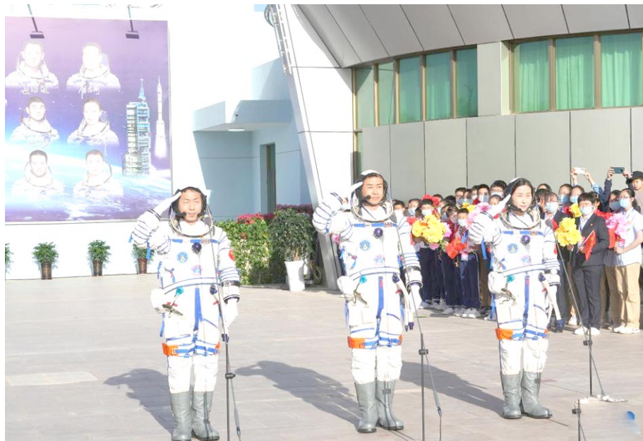
A see-off ceremony for three Chinese astronauts of the Shenzhou-14 crewed space mission is held at the Jiuquan Satellite Launch Center in northwest China

A/C Non A/C Rooms with Car Parking At POGL Brahmaputra, Chandmari, Guwahati-21 Ph. WA : 9678009493/9707183470