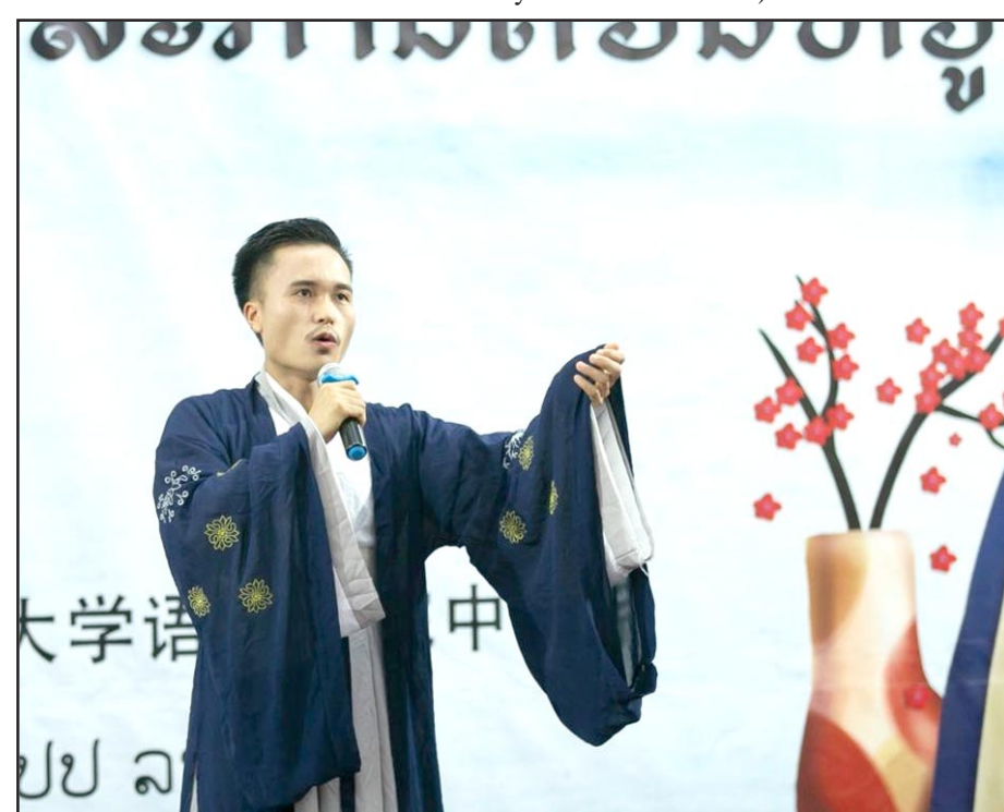
A Lao student performs during a Chinese poetry recitation party on the occasion of Dragon Boat Festival, at the National University of Laos

temperature is likely to touch 43 degrees Celsius, the IMD said. IMD said that isolated places in Rajasthan, Jammu, Himachal Pradesh and Delhi will witness heatwave on June 4 and 5. The weather office also said that areas in Vidarbha, Jharkhand, interior Odisha and Chhattisgarh will witness heatwave conditions from June 4 to 6. South Uttar Pradesh and north Madhya Pradesh will witness heatwave conditions from June 7 to 8. Met Office said there is likely to be an increase in rainfall activity likely over South Peninsular India from June 7. - It predicted an intense spell of rainfall over Northeast India and Sub-Himalayan West Bengal and Sikkim during the next five days.