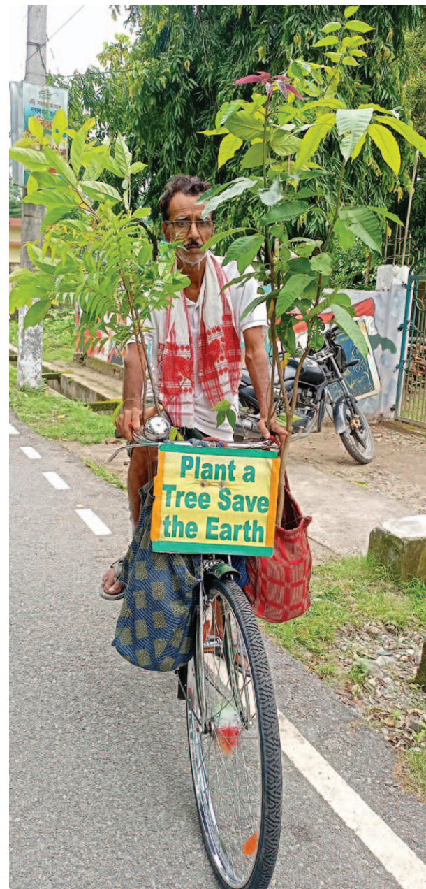
Bongaigaon- awareness campaign for Environment