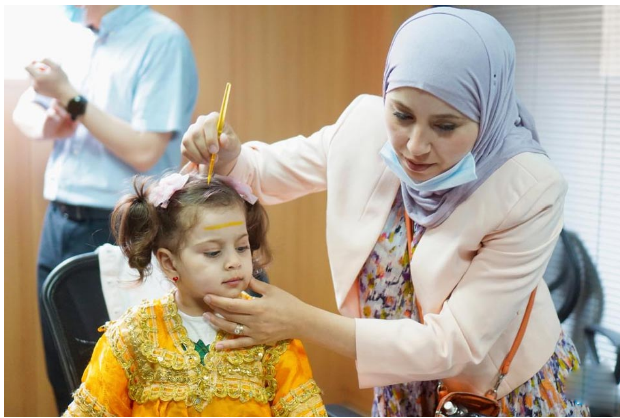
An Algerian child has her forehead painted during a Dragon Boat Festival event in Algiers, Algeria.