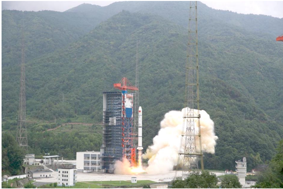
A Long March-2C carrier rocket carrying a group of nine commercial satellites blasts off from the Xichang Satellite Launch Center in southwest China