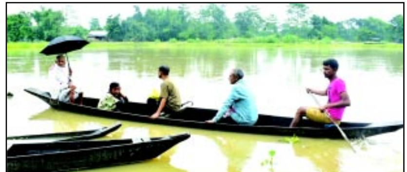
Dhakuakhana- People crossing the Charikoriya River with boat