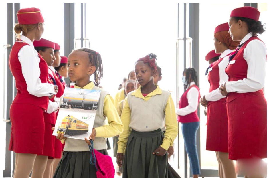
Students of Jemo No. 2 Elementary School visit the Furi-Lebu Railway Station in Addis Ababa, capital of Ethiopia.

economic and security deal proposed by Beijing, after a crucial meeting of Pacific foreign ministers and their Chinese counterpart on Monday. Ten Pacific countries were to be part of the deal. Samoa's position was that region-wide agreements must first be taken to the Pacific Islands Forum. Fiame said she believed Pacific countries had concluded that "we need to meet as a region to consider any proposal that is put to us by our development partners that requires a regional agreement".