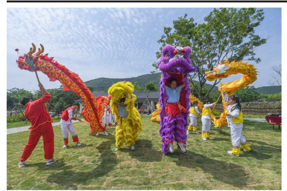
Children attend activities celebrating the upcoming Dragon Boat Festival at a farm in Huzhou City