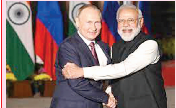
Moscow, June 01:

President Vladimir Putin may need to count even more on China and India should the European Union ban Russian oil, with few other takers in