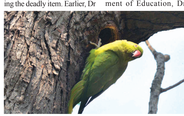
Guwahati- Parrot take rest branch of tree

Rising, enue collection of Rs.6,39,23,389. Altogether 2,74,116 domestic and 1,719 foreign tourists visited the park. In 2020-2021 the park received 1,67,644 tourists with total revenue garnered being Rs.3,60,00,611. In the year 2019-2020, a total of 1,42,859 tourists visited the park, generating a revenue of Rs.4,20,63,541. The tourist flow to the park was affected during the period 2019-2020 and 2020-2021 due to COVID-19 pandemic. In 2018-2019, the inflow of tourists was partially affected due to