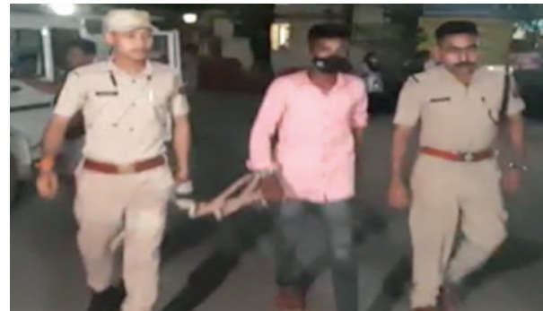
Assam Rising Guwahati, May 30:

The prime accused, who allegedly incited a mob to burn down the Batadrava police station in Assam's Nagaon last week, died early on Monday, allegedly in a road accident while try-