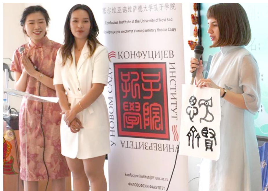
A contestant shows her Chinese calligraphy work during a Chinese language competition in Belgrade, Serbia,