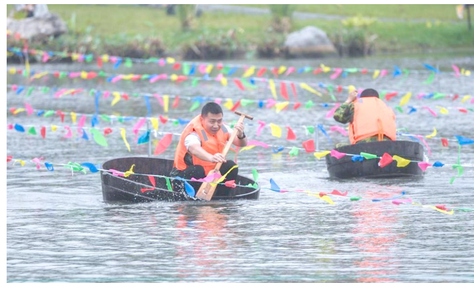
Villagers take part in a barrel rowing competition in Baoguo Village, Donglin Township of Huzhou

going public, and more have privately indicated they will do so. If 54 or more MPs submit letters to Brady, a leadership contest will be triggered. "I reckon we are in the 40s," said one rebel MP. Another added: "We are just a few off." On Thursday and Friday there was a mood of relief bordering on jubilation in Downing Street as Johnson and his team believed they had survived the publication of a damning report on Partygate by the senior civil servant Sue Gray, and then switched focus on to measures to address the cost of living crisis on Thursday. While a £15bn package of measures announced by Sunak was broadly welcomed, many Tories were unhappy that the government funded part of it by performing a massive U-turn which saw it adopt Labour's plan for a windfall tax on the profits of oil and gas companies.