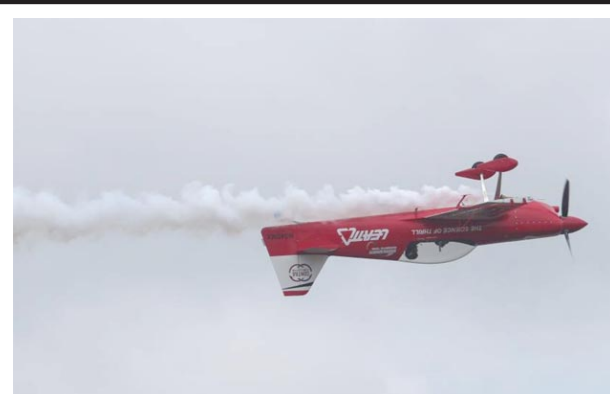
An aircraft gives aerobatic performance during the Museum Air Show Festival in Nairobi, Kenya