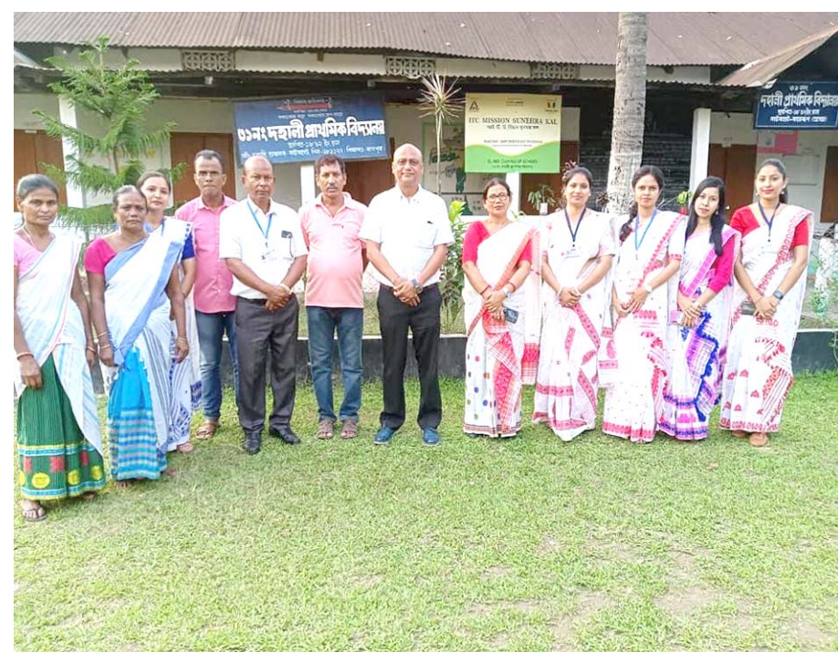
Gunotsav-2022 programme at 31 No Dahali L.P School on Thursday.