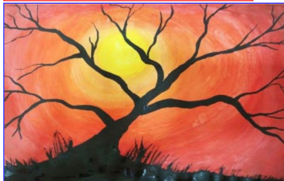
Arunima Shyam, Class - VI, Siksha-The Gurukul, Doomdooma