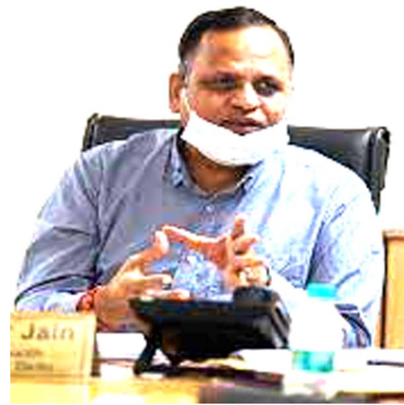
Nicotine found in tobacco is very harmful to health and well-being. Due to its

with the objective of spreading awareness about the ill-effects of tobacco and drugs, to provide better training to the dentists of the country and to conduct research on dental health", adding "It is the first national resource centre among the total 315 dental colleges in the country." Launching the official logo of the NRC-OH-TC, the minister said that most of the people are still not aware about their oral health and dental hygiene, and this is the reason why the cases of oral cancer are increasing rapidly, even among the youth. "Every year more than seven million deaths occur due to tobacco use alone across the world. This is an alarming signal for the people.