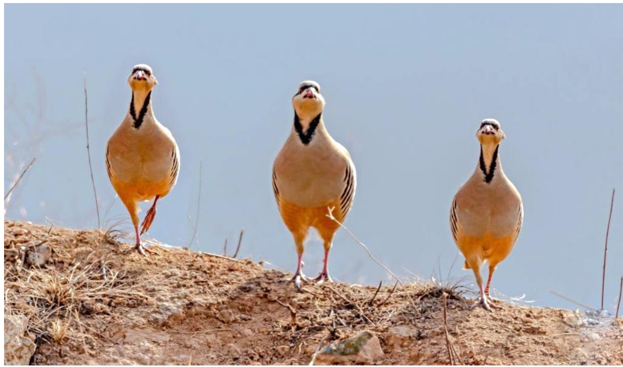
Undated photo shows chukars in Pinglu County, north China's Shanxi Province