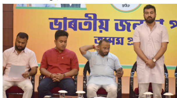
Bharatiya Janata Yuva Morcha organised a meeting at Vajpayee Bhawan, Guwahati on May 24.