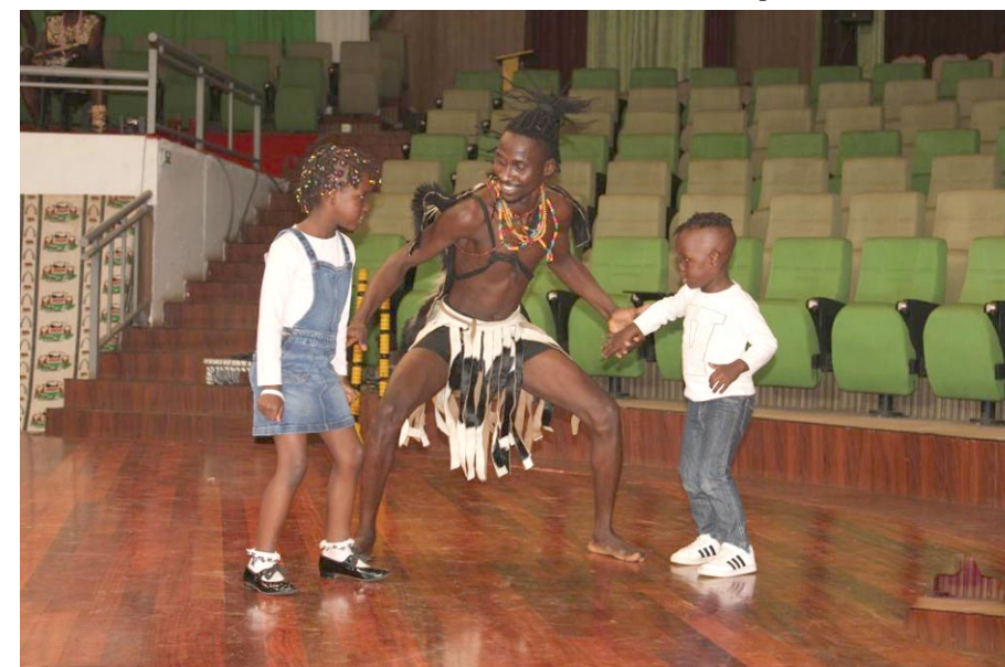
A dancer guides children to dance at the Bomas of Kenya in Nairobi, Kenya

of the working group Illicit Antiquities Trafficking of the Unesco chair on threats to cultural heritage and cultural heritage-related activities, Ionian University, Greece. Through his research, he received official access to tens of thousands of images and other archival material seized in police raids from individuals involved in the illicit trade.