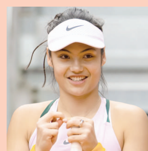
also enjoyed trips to Paris with the LTA when she was much

Paris, May 22 : As Emma Raducanu makes her French Open main draw debut on Monday, she will enter the court filled with positive memories on her return to Paris for the first time in four years. The last time Raducanu competed here was at the French Open juniors in 2018, where she lost in the second round to Clara Tauson of Denmark. She