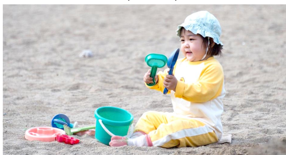
A kid plays at a park in Xiangfang District of Harbin

as Reuters reported last week. The rocket with Starliner aboard launches from Cape Canaveral, Florida, on Thursday.