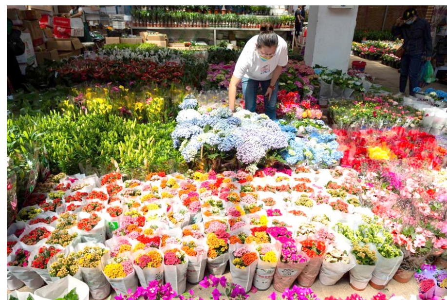
A woman shops at a flower market in Harbin, northeast China's Heilongjiang Province

state Antony Blinken demanded that Russia lift its blockade of Ukraine's Black Sea ports and enable the flow of food and fertiliser around the world. "The Russian government seems to think that using food as a weapon will help accomplish what its invasion has not - to break the spirit of the Ukrainian people," he said at the meeting called by the Biden administration. "The