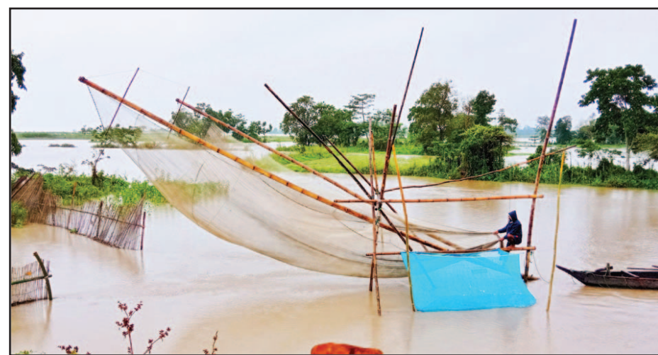
Dhakuakhana- A fisherman catching fish on Thursday