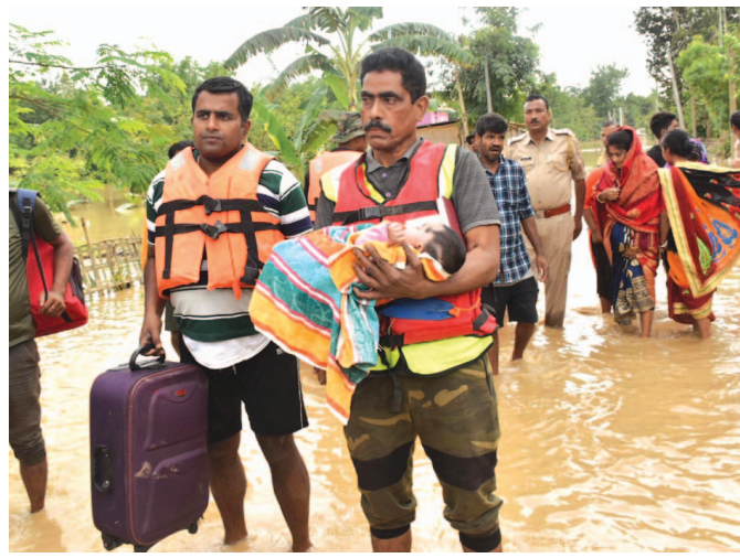
Hojai- flood on Thursday

allowed to do so." Mamata also blamed the CPM (CPIM) for alleged SSC recruitment corruption case. She said, "They're talking big. They used to transfer with a note. In 34 years of the CPM rule, I have searched a lot. I'll open all the chapter slowly. I didn't because I was polite." Mamata also gave a message to the party workers to remain corruption-free. She advised the people of the state to write directly to the Chief Minister and lodge a complaint if they do not get the prescribed funds for any project. Mamata has even talked about taking legal action.