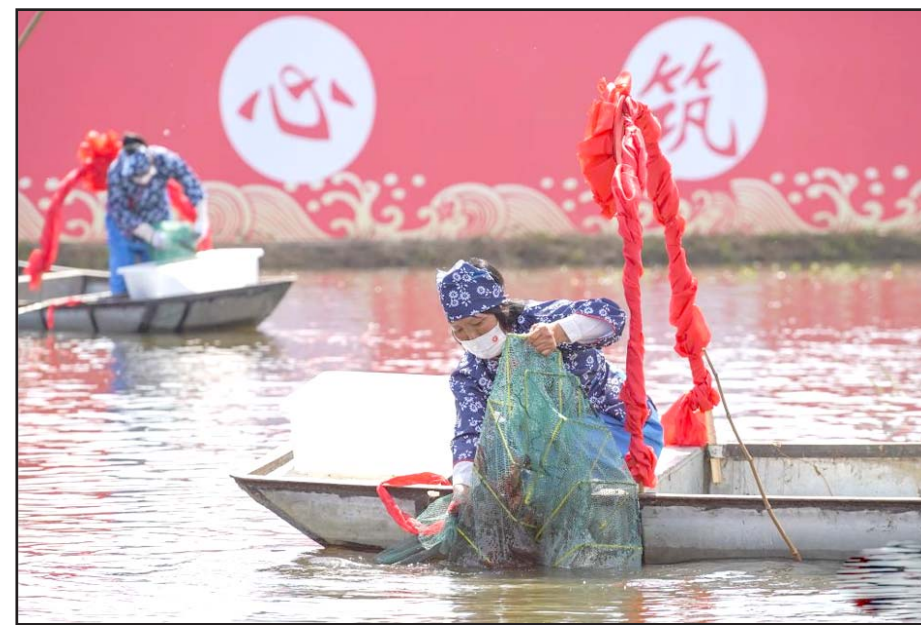
Workers net crayfish during an event celebrating the harvest season of crayfish in Xuyi County of Huai'an, east China's Jiangsu Province