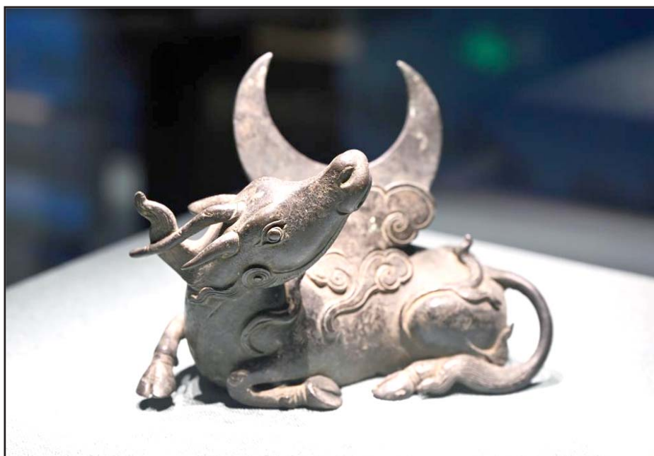
A rhinoceros-shaped mirror bracket of the Qing Dynasty (1644-1911) is exhibited at Hainan Museum in Haikou, south China's Hainan Province

international mediators". It is also not clear how many remain inside the plant. Denis Pushilin, the head of the self-proclaimed republic of Donetsk, said on Wednesday that the "commanders of the highest level" were still hiding in the plant. Earlier, Ukrainian officials had said some of its soldiers remained. The two sides in the war have released practically no details of the agreement that led to the surrender of the troops, who were holed up for weeks in an extensive network of tunnels and bunkers underneath the steelworks.