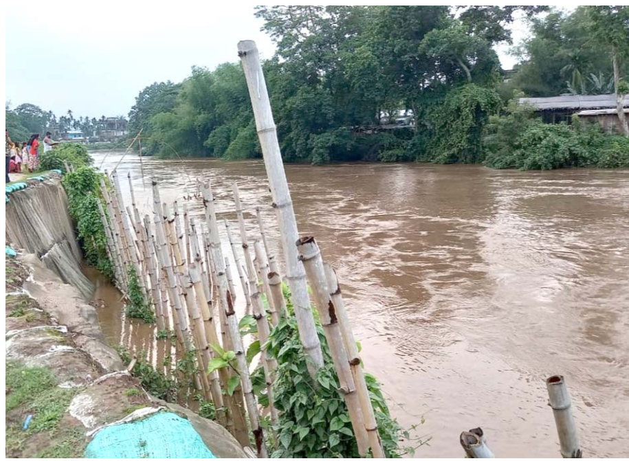
Water level of river Kalahi in Chhaygaon rises.