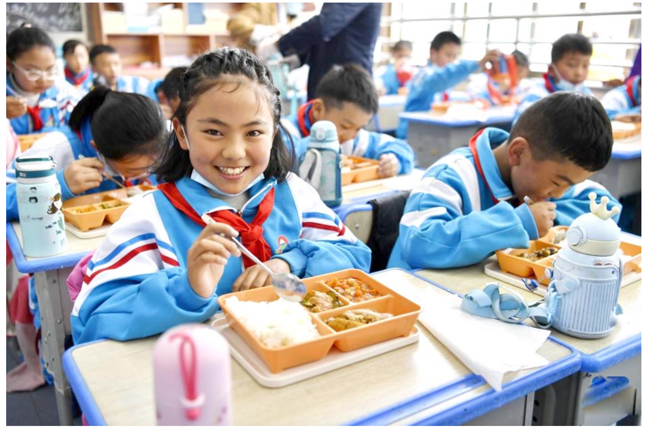
Students of a branch school of Lhasa Experimental Primary School have lunch in Lhasa

Some 600 troops were believed to have been inside the steel plant. The regiment, which has in the past had nationalist far-right affiliations, was a militia formed to fight the Russians after the invasion of Ukraine in 2014 but has become a unit of the Ukrainian national guard. It said its troops in Mariupol, on the Sea of Azov in the south-east, had held out for 82 days, buying time for the rest of Ukraine to battle Russian forces and secure western arms needed to withstand Moscow's assault.