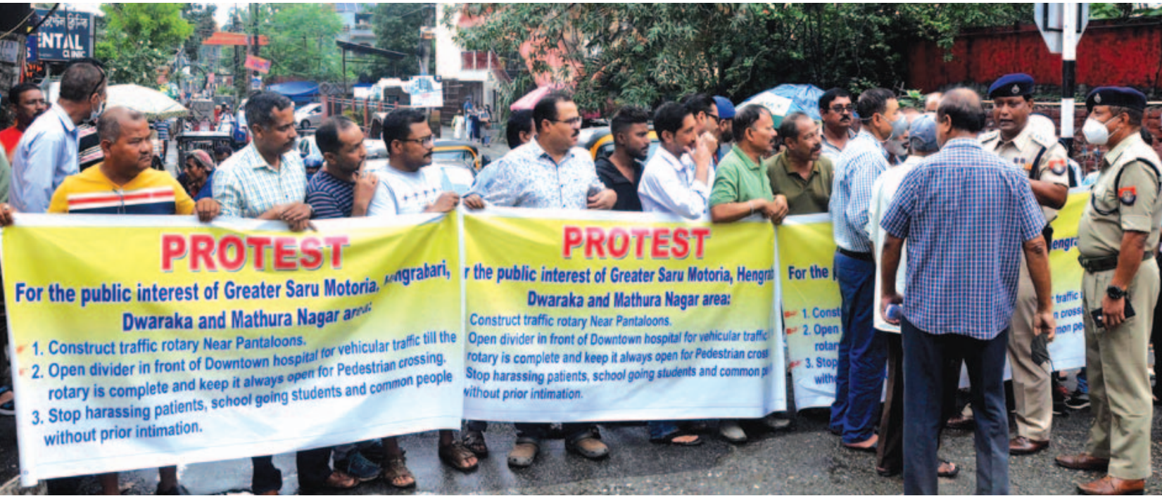
Guwahati- Residents of Down Town area protest on Tuesday