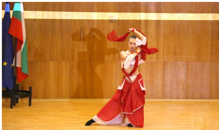
A contestant performs during a Chinese language competition in Veliko Turnovo, Bulgaria.

Wellington, May 17 : New Zealand's house prices are on track to drop by up to 20% in the next year - the biggest drop since the 1970s - two of the biggest banks have predicted, which would take prices back to where they were just over a year ago. For years, the country has been plagued by a runaway housing market. The cities of Wellington and Auckland have some of the least affordable property markets in the world, and homeownership rates have been falling since the early 1990s across all age brackets, but especially for people in their 20s and 30s. Now, New Zealand is in the midst of some of the largest drops and slowdowns since the aftermath of the global financial crisis. The number of houses sold in April was down 30% from the month prior, according to the Real Estate Institute and, according to Westpac, prices fell by 1.1% in April - now down 5% from their peaks in November.