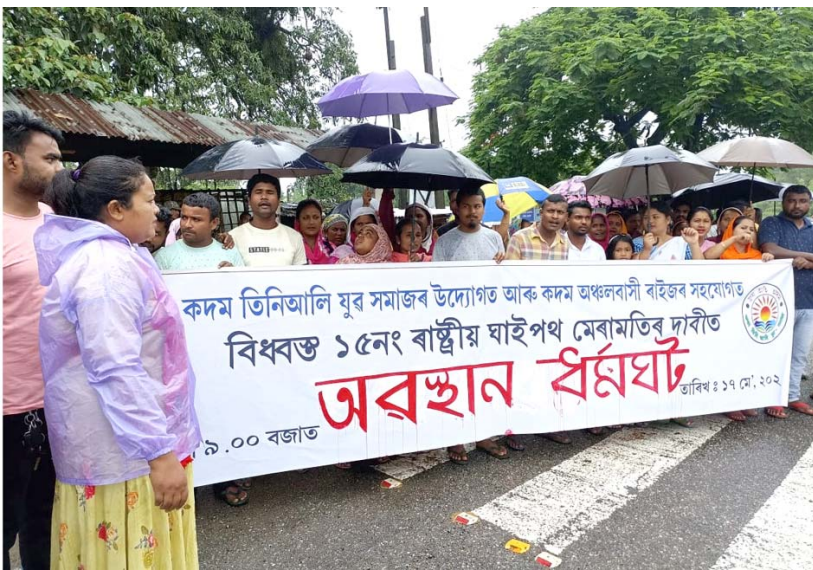
Protest against the worsening condition of NH No.15 at Boginadi on May 7.