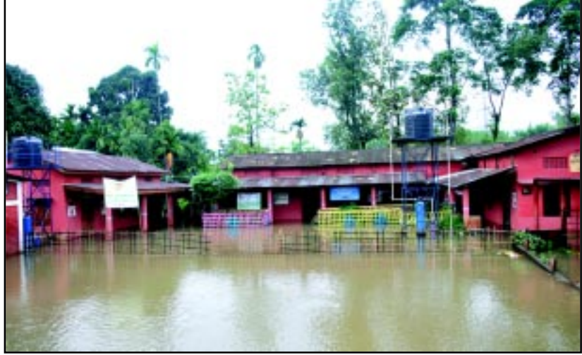
Gohpur- Submerge the flood water on Monday