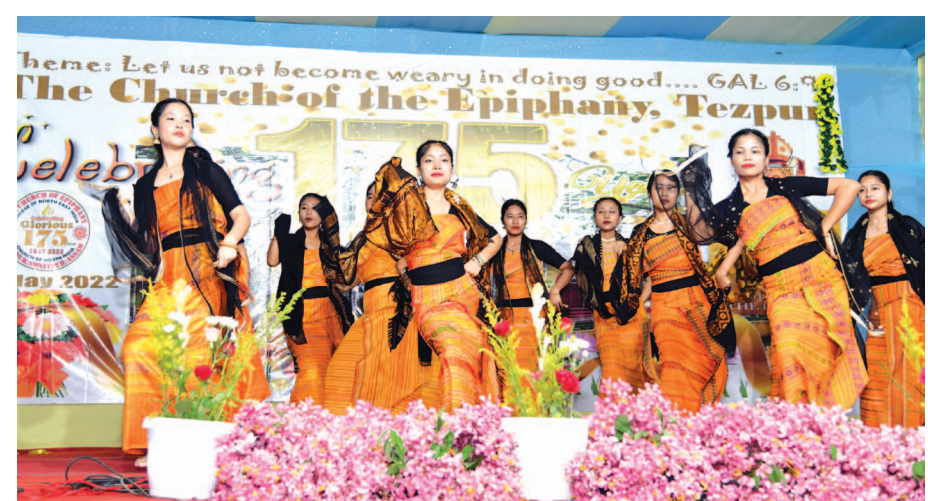
Tezpur- 175 years celebration of The Church of the Epiphany