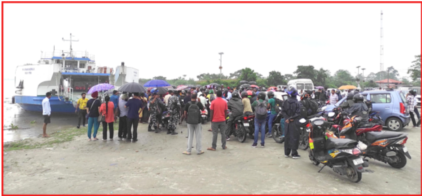
Majuli- ferry service closed