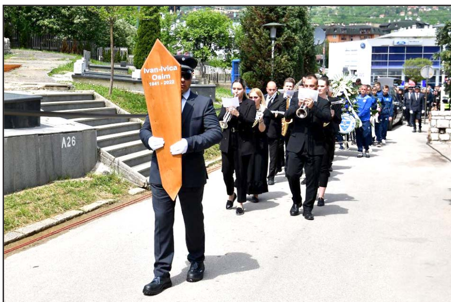
People march to the burial place during the funeral of Ivica Osim in Sarajevo, Bosnia and Herzegovina

London, May 15 : Fewer than half of people in Scotland say they support retaining the monarchy, according to a major new poll that reveals the cultural divides emerging within the union. Almost six in 10 people across Britain want to retain the monarchy for the foreseeable future, with only a quarter saying that the end of the Queen's reign would be an appropriate time for Britain to become a republic. The overwhelming majority, some 85%, expect that Britain will still have a monarchy in a decade's time. However the poll, by the British Future thinktank, found that only 45% in Scotland said they wanted to retain the monarchy - with 36% saying the end of the Queen's reign would be the right moment to move to a republic. Some 19% either rejected the choice, or said they didn't know. It also revealed weaker support among young people and ethnic minorities across Britain. Only 40% of 18 to 24-year-olds backed keeping the monarchy, while 37% of