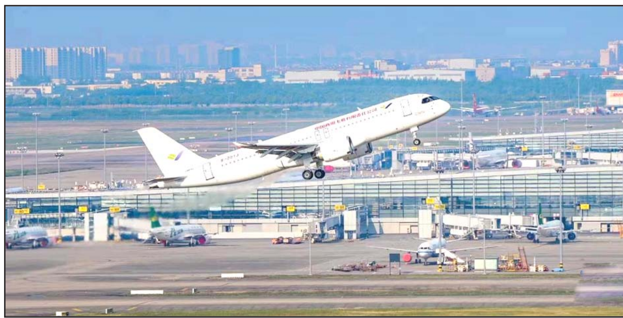
The first C919 large passenger aircraft to be delivered takes off from Shanghai Pudong International Airport in Shanghai.

president since 2012 and one of a handful of western leaders who has been in regular dialogue with Putin over the past decade. Niinistö said he had already told Putin at their first meeting in 2012 that "each independent nation would maximise its own security". "That is still the case. By joining Nato, Finland will strengthen its own security and assume its responsibilities. It is not something away from anybody," Niinistö said.