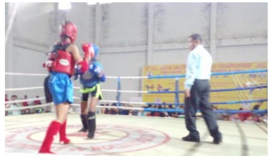
All Assam Amateur Muay Thai Championship, 2022 is going on at Sonapur College

Guwahati. Similarly, Train No. 15641 Silchar - New Tinsukia express, commencing journey on May 14 has been canceled between Silchar and New Tinsukia. Train No. 15642 New Tinsukia - Silchar express, commencing journey on May 15 will remain canceled between New Tinsukia and Silchar. Train No. 15626 Agartala - Deoghar express, commencing journey on May 14 has been canceled between Agartala and Deoghar. Train No. 15625 Deoghar - Agartala express, commencing journey on May 16 will remain canceled between Deoghar and Agartala. Train No. 15611 Guwahati - Silchar express, commencing journey on May, 14 has been canceled between Guwahati and Silchar. Train No. 15615 Guwahati - Silchar express, commencing journey on May 14 has been canceled between Guwahati and Silchar.