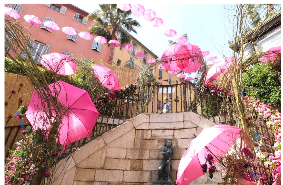
Roses and pink umbrellas are seen during the 50th ExpoRose in Grasse, southern France

London, May 14 : Coleen Rooney has been told she cannot provide "one shred of evidence" that Rebekah Vardy leaked stories from a private Instagram account to the Sun - but insisted she has strong reason to "believe" Vardy was responsible based on circumstantial clues. Rooney told the "Wagatha Christie" libel trial that leaks from her private Instagram account to the Sun caused issues when she was dealing with difficulties in her marriage to former footballer Wayne Rooney. She said one private Instagram post in 2017 made its way to the tabloid at a time she and Rooney were "trying to figure out our relationship" and were spending time apart, after he crashed his car while drink-driving with another woman in the vehicle. She said it was upsetting when the Sun learned of the private photo, which suggested the family