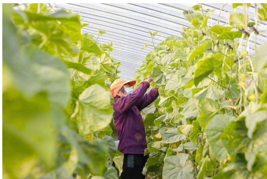
A villager harvests cucumbers inside a greenhouse in Xiangyangzhuang Village of Tangyin County

could be sure." He repeatedly told Rooney that beliefs do not count as hard evidence: "You might believe Derby County might win the Premiership in two years' time. It's not evidence is it?" Wayne Rooney, the Derby County manager, did not react when he heard the jibe about his football team, which have been recently relegated to League One - the third tier of English football - amid financial difficulties. Coleen Rooney is being sued for libel by fellow footballer's wife Vardy, who denies Rooney's public accusation that she passed stories from Rooney's Instagram account to the Sun newspaper. Vardy is married to the Leicester City striker, Jamie Vardy. Rooney insisted there was overwhelming evidence that Vardy's Instagram account was accessing the leaked material. "I thought a lot about this," she said. "I've been in the public eye for 20 years. I've become quite savvy to the way people work and journalists work. I hate gossips, I'm not a gossip. It all added up to me that it came from this account."