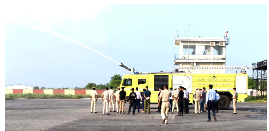
Dhubri- Rupsi Airport mock drill on Thursday