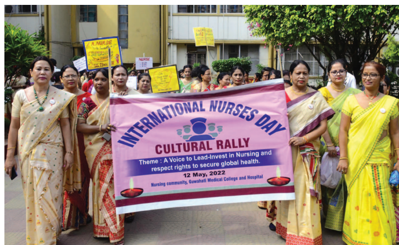
Guvahati- International Nurses Day Cultural rally on Thursday

by Mughal emperor Shah Jahan. "When Shah Jahan took the land of the Jaipur Royal family, the latter could not oppose him because it was under his control at that time," Kumari said. "The Jaipur Raj Parivar Trust possesses the land records. If the court orders, then the Royal family will present the documents," the BJP MP told the media. She added, "Even today if a government acquires any land, it gives compensation in return for it. Some kind of compensation was given at that time too, but there was no law to appeal against Shah Jahan or take any action against him. Now it is good that someone has raised their voice and filed a petition in the court." Kumari said, "It is a good thing that someone has appealed to open the doors of the Taj Mahal so that the truth comes out. We are also examining the matter now." Earlier during the Ayodhya temple dispute, the Jaipur Royal family had claimed that they were descendants of Lord Ram.