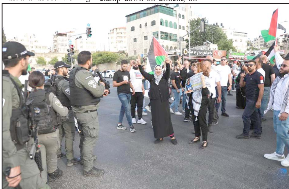
Palestinian people protest against the killing of Al-Jazeera journalist Shireen Abu Akleh in Jerusalem,