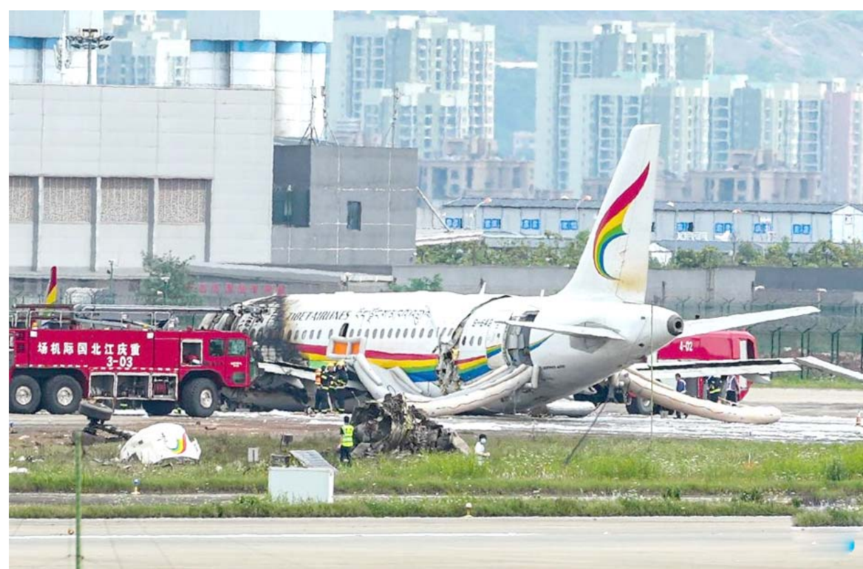
shows the accident site where a passenger plane veered off the runway during take-off and caught fire at the Chongqing Jiangbei International Airport in southwest China's Chongqing