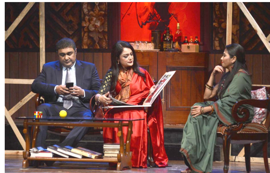
Guwahati- Drama We ARC MALICO