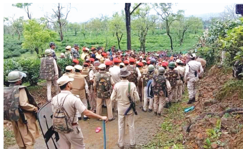
Silchar- eviction drive for making Greenfield Airport on Thursday