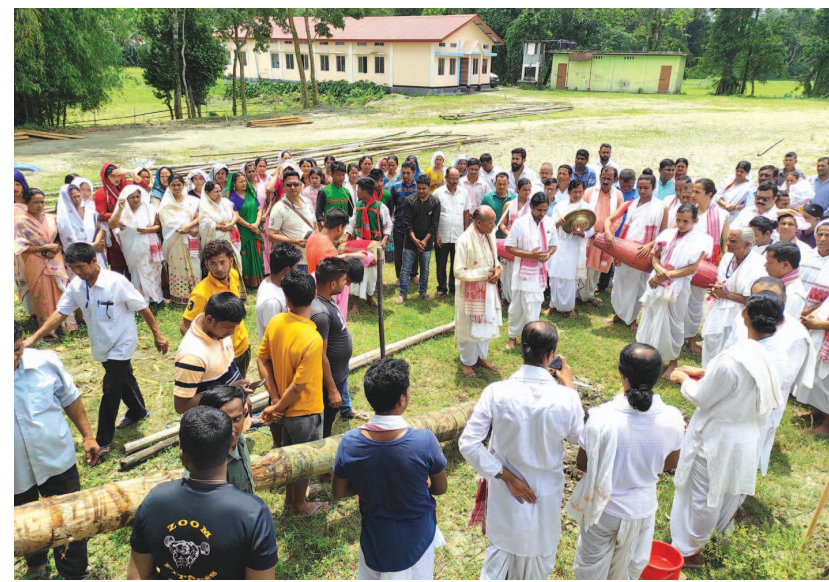
Majuli- laying lakhuta Abirbhab Mahotsav on Thursday