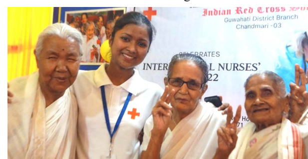
Guwahati- Old age home Celebrate International Nurses Day