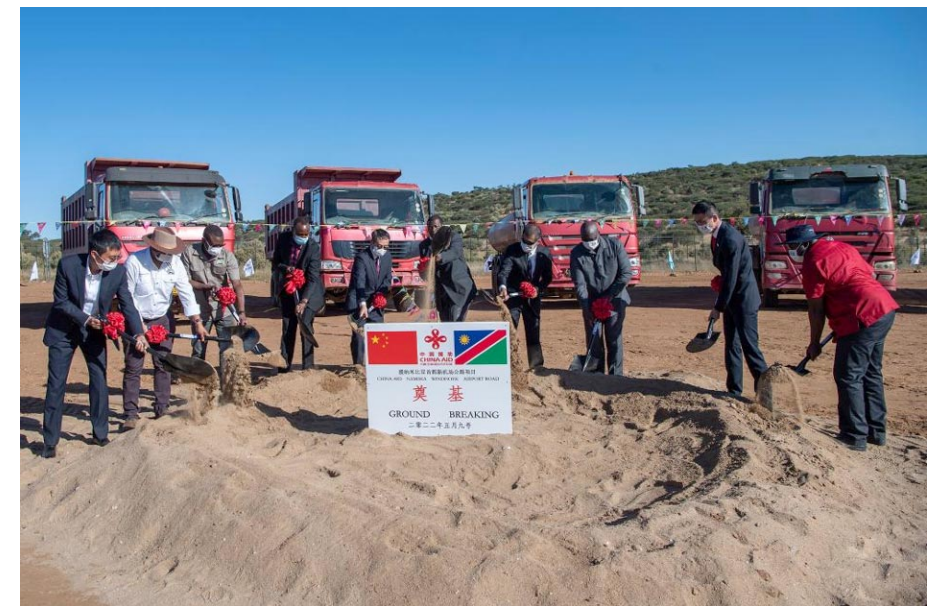
Guests attend an official groundbreaking ceremony of a China-aided project in Windhoek, Namibia.

aged man, clad in a red protective suit with a face mask and a face shield, pointed out that there was always a limit to the power government officials are entitled to, and citizens' rights should not be abused. "Let me tell you," the man said, "you can only use your power with the authorisation of law... You have to tell me which items in our country's law allowed you to carry out your public power today? ... Therefore, you cannot enforce hard isolation upon us."