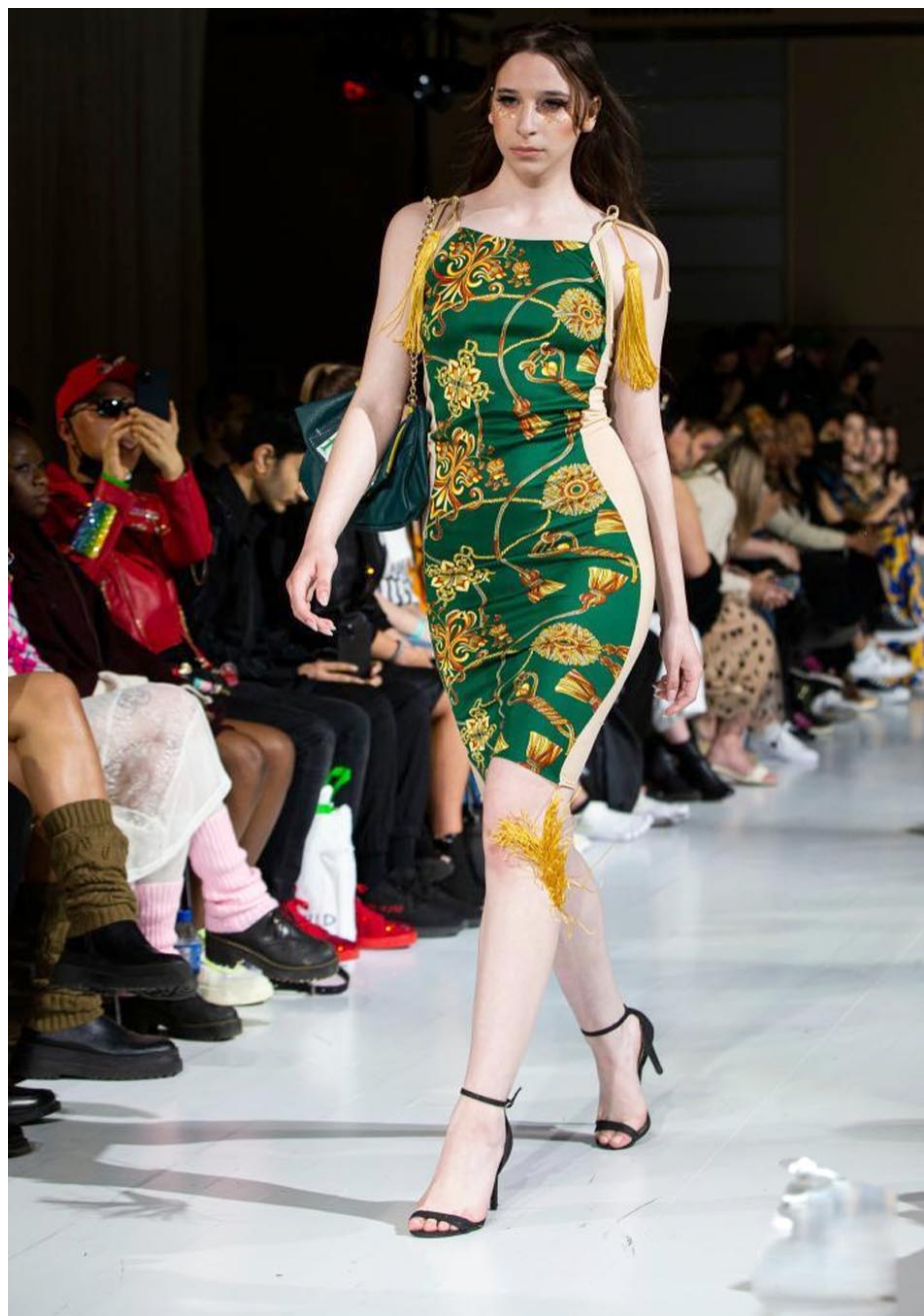
A model presents a creation of Flors Fashion during the Fashion Art Toronto in Toronto