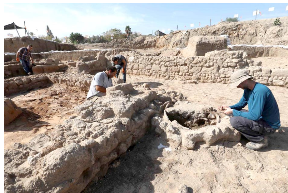
Staff members of Israel Antiquities Authority (IAA) work at an excavation site in central Israeli city of Yavne

suspended. The company said Dorsey would step down immediately but that Dorsey would remain on the board until Twitter's stockholder meeting in 2022. "I've decided to leave Twitter because I believe the company is ready to move on from its founders. My trust in Parag as Twitter's CEO is deep. His work over the past 10 years has been transformational. I'm deeply grateful for his skill, heart and soul. It's his time to lead," said Dorsey. "I want to thank the board for their confidence in my leadership and Jack for his continued mentorship, support and partnership," said Agrawal.