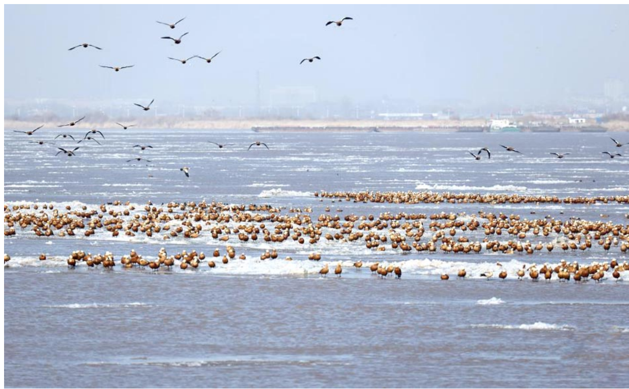
Birds perch on flowing ice at the Yellow River's middle reaches in Dalad Banner of Erdos, north China's Inner Mongolia Autonomous Region