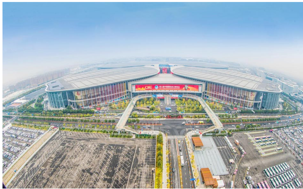
shows a view of the National Exhibition and Convention Center (Shanghai), the main venue of the 3rd China International Import Expo (CIIE), in east China's Shanghai