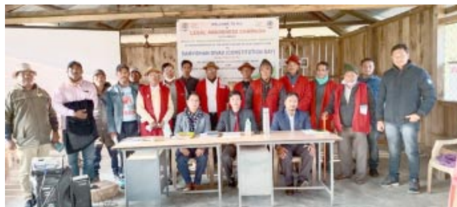
Assam Rising, Reporter, Aalo Nov 28: Along with the rest of the India, Office of the Legal Aid Clinic at the premises of Additional District & Ses-

sions Court-cum-Chairman, District Legal Services Authority, Upper Subansiri District, Camp: Basar, A.P has conducted legal aware-