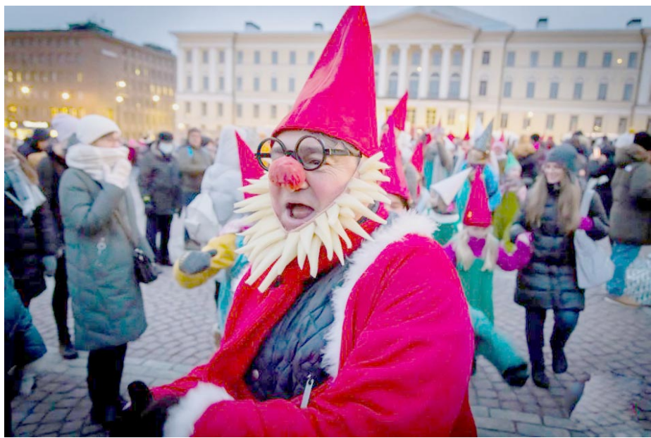
Christmas opening event held in central Helsinki