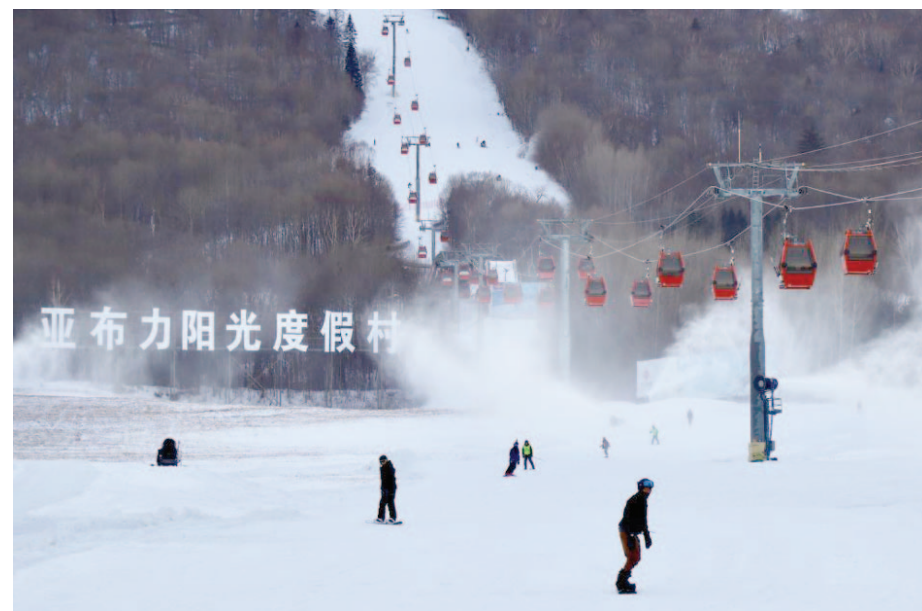
Tourists enjoy skiing in Yabuli, NE China

admitted he was prepared to be "economical with the truth" to protect national security under cross-examination from barrister Malcolm Turnbull, who later became Australia's prime minister. Ministers also gagged newspapers in England from reporting on Wright's claims against MI5. The government was found in November 1991 to have violated the right of freedom of speech because of gagging orders against the Observer and the Guardian. Tate first made a request for the files to the Cabinet Office in April 2019. Under the Public Records Act 1958, records selected for permanent preservation are required to be transferred no later than 30 years after their creation either to the National Archives in Kew, south-west London, or another suitable place of deposit.