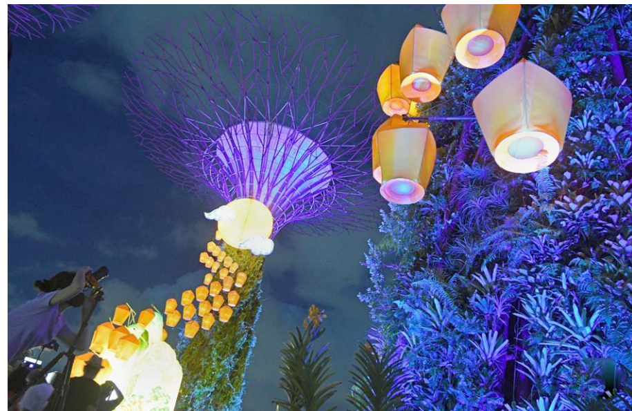
shows lanterns at an event to greet the coming Mid-Autumn Festival at Singapore's Gardens by the Bay

is stable and everything is going to be OK... we are not going to attack," Milley told Li four days before the November 2020 election, according to the book. The idea that a general would unilaterally intervene to secretly prevent or halt the actions of the president of the United States, who is commander-in-chief of the US military, is extraordinary. Milley served Trump as chairman of the joint chiefs and then continued in the role after Biden entered the White House. Psaki on Wednesday urged Americans to consider the "key context" in which Milley allegedly took these steps, referring to Trump's efforts to overturn Biden's victory in an election called the most secure in US history by officials at local and national level. "The president has worked side by side with Chairman Milley for almost eight months," Psaki said. "His experience with him has been that he is a patriot." The revelations have led some Republicans to call for Milley's resignation, accusing him of undermining the constitution by trying to put guardrails on Trump's behavior during his final days in office. Woodward, who broke the Watergate stories that ultimately led to Richard Nixon's resignation as president in 1974, and Costa portray Milley as "certain that Trump had gone into a serious mental decline in the aftermath of the election".