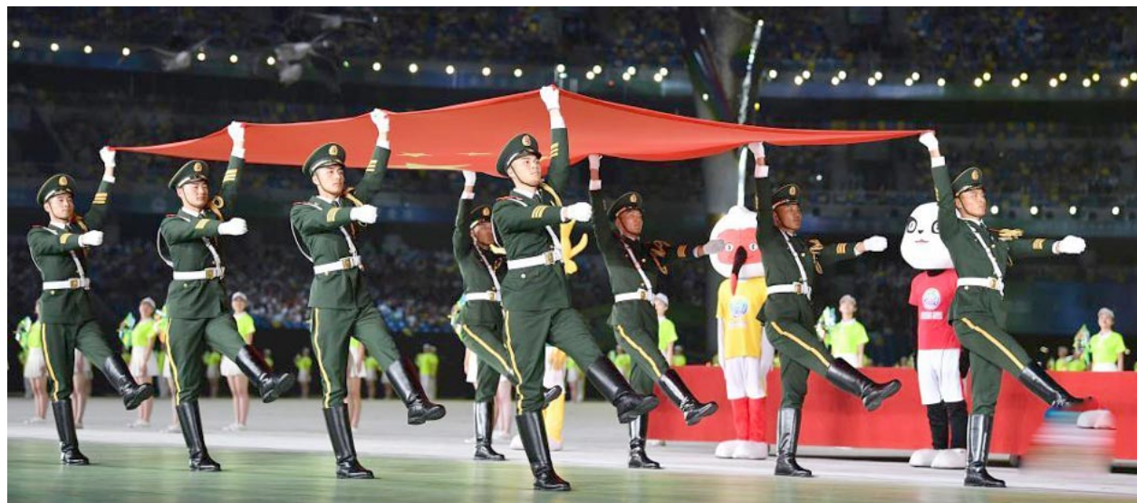
The Chinese national flag is carried to the stadium during the opening ceremony for China's 14th National Games in Xi'an, Shaanxi Province