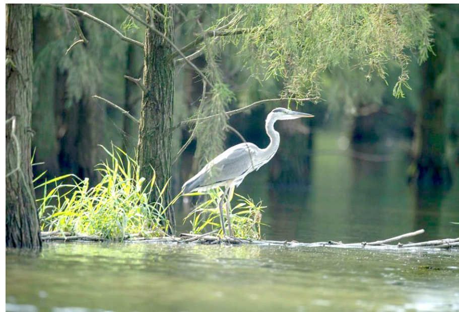
A bird rests at the Chishan Lake National Wetland Park in Chuzhou, east China's Anhui Province

fraudulent claims. The governor also faced harsh criticisms over the state's initially slow vaccine rollout and its ineffectual sign-up site. An ill-timed, lobbyist-laden dinner at the Michelin-starred French Laundry restaurant amid the state's Covid-19 surge last November gave his opponents further ammunition against him. Having survived the recall, Newsom will serve one more year before he is up for re-election.