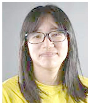
Hong Kong, September 10 : Hong Kong police have charged the group

that organises the city's annual Tiananmen candlelight vigil and three of its leaders with subversion under the national security law, amid an ongoing crackdown on dissent. The Hong Kong Alliance in Support of Patriotic Democratic Movements of China said that the group, its chairman, Lee Cheuk-yan, as well as vice-chairs Albert Ho and Chow Hang-tung were charged