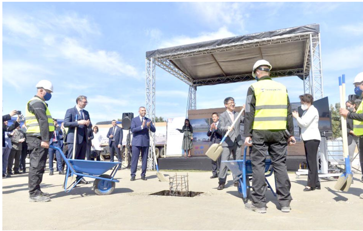
Serbian President Aleksandar Vucic (2nd L, Front) attends the ceremony of laying the foundation stone for a COVID-19 vaccine production factory in Belgrade, Serbia