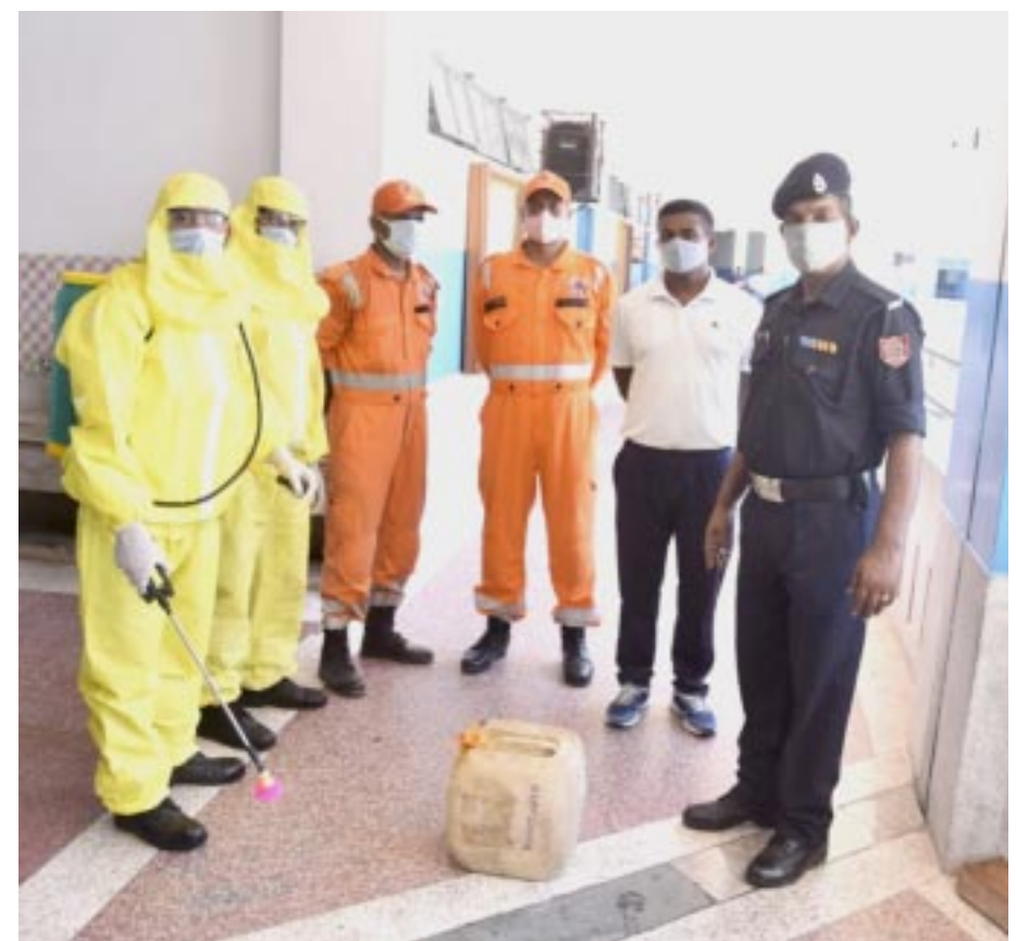
1st Bn NDRF Has Sanitized The St Clare's Convent High School, Borzar, Guwahati

tion of the bridge. "This indicates the commitment both the Centre and state government has towards the people of Majuli. Steps will also be taken by both the governments to improve the infrastructural facilities at both the Nimatighat and Kamlabari ghat at the earliest," he added. The boat collision was a "very tragic and unfortunate incident. I was in Delhi and immediately called up Chief Minister Himanta Biswa Sarma to discuss the matter. The prime minister and the Union home minister also assured all help to rescue the passengers," he said.