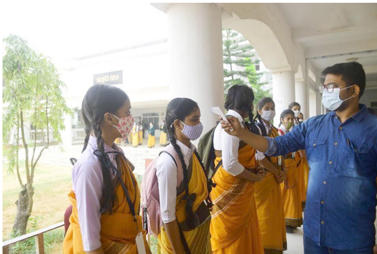
Students have temperature checked before entering classroom on the first school day at Agartala, the capital city of India's northeastern state of Tripura