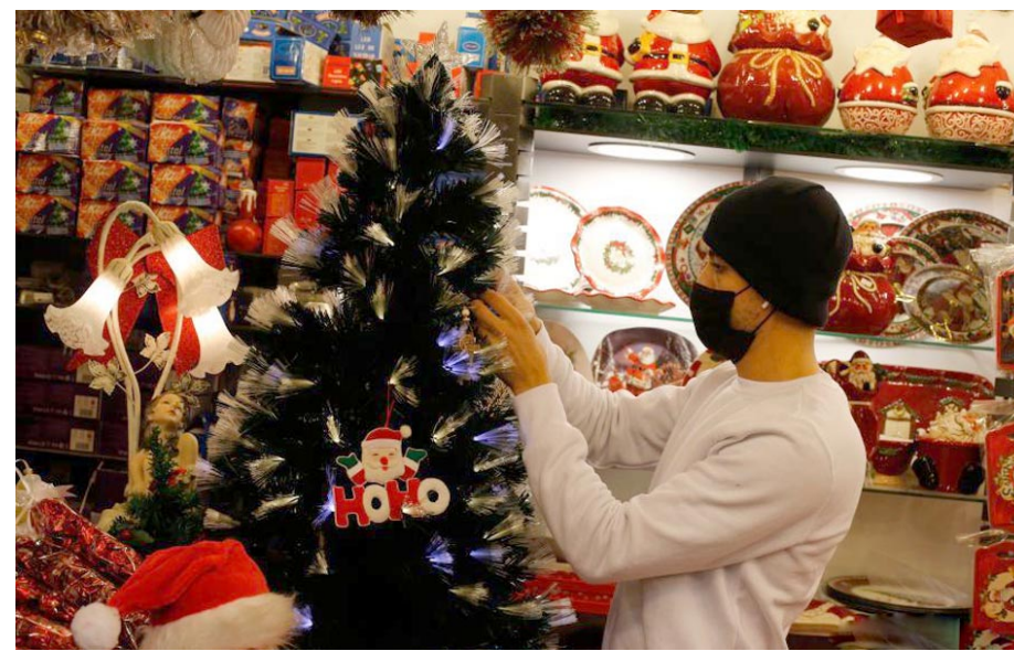
A shop vendor arranges Christmas decorations at a shop in Jerusalem's Old City.