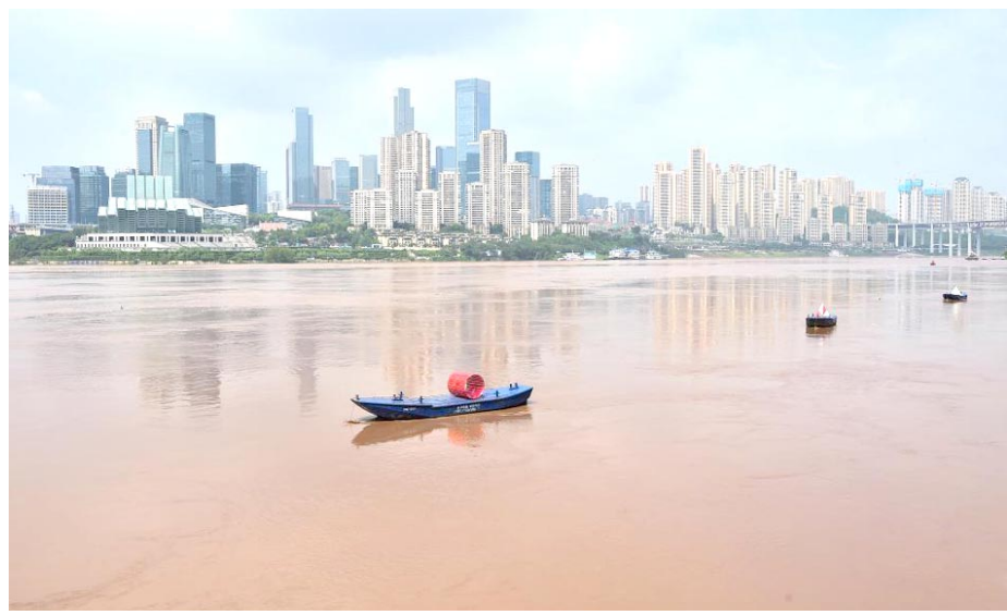
shows a view of a dock in southwest China's Chongqing Municipality