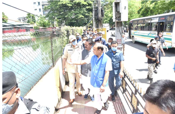
Staff Reporter Guwahati, September 8

Chief Minister Dr. Himanta Biswa Sarma today inspected the proposed sites identified for construction of new office buildings of