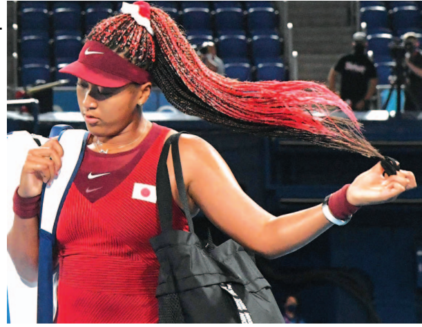
injured more than 5,700. Osaka, who is of Haitian and

The tennis star Naomi Osaka has announced that she will donate prize earnings from her next tournament to support relief efforts in Haiti, where a 7.2 magnitude earthquake killed at least 1,297 people over the weekend and