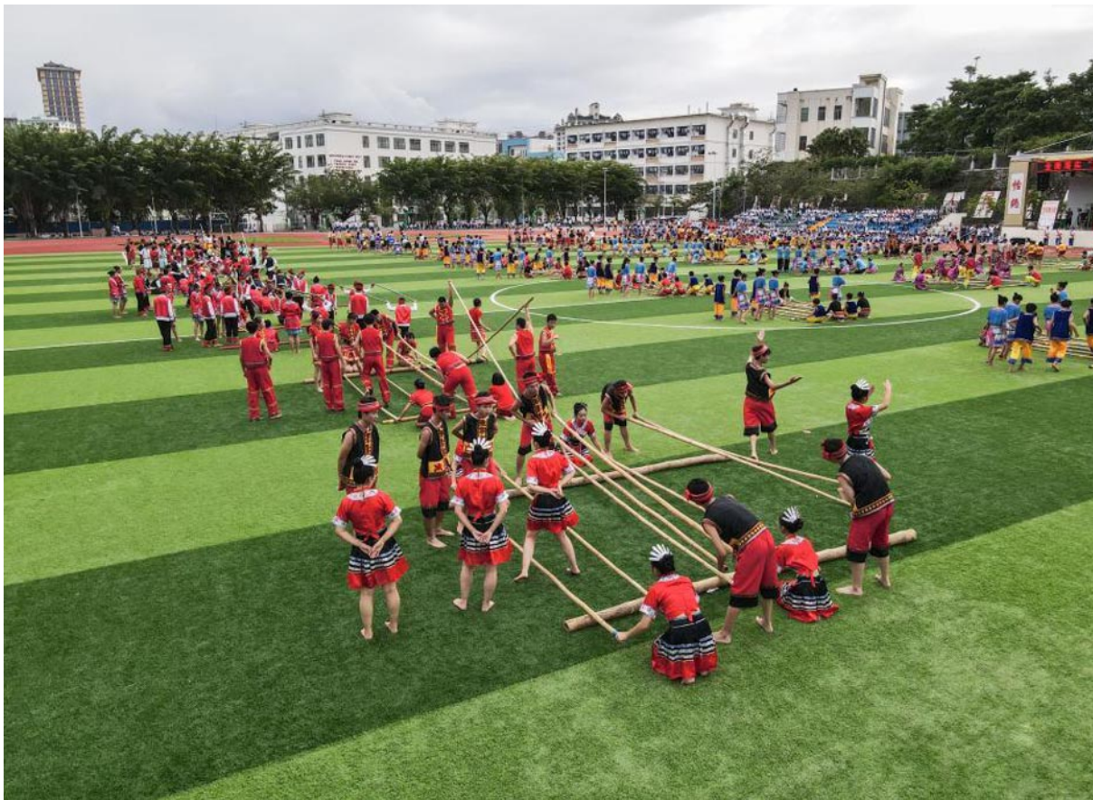
Students participate in a bamboo dance competition at Baoting Middle School in Baoting Li and Miao Autonomous County,