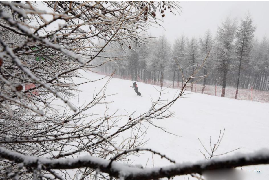
A skier is seen at a ski field during a snowfall in Chongli District of Zhangjiakou City, north China's Hebei Province

Sd/- Divisional Soil Conservation Officer Nalbari Soil Conservation Division, Nalbari Janasanyog/C/7128/20