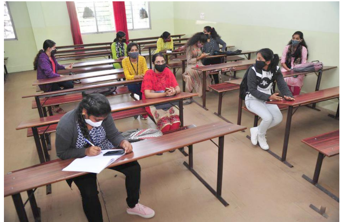
Students attend classes following strict COVID-19 safety protocols at a college that reopened amid the COVID-19