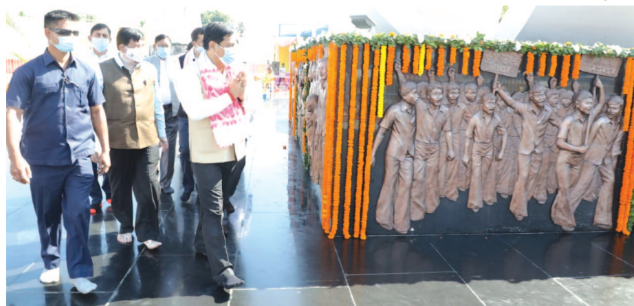
Chief Minister Sarbananda Sonowal is inaugurating newly constructed Swahid Bedi at Howly in Barpeta district